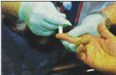
Station residents get their fingers pricked and their blood drawn as part of the Health Fair March 6.