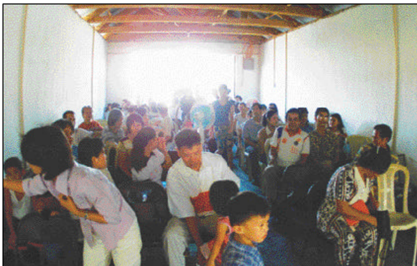
Neighbors and worshippers take their seats moments before mass begins.