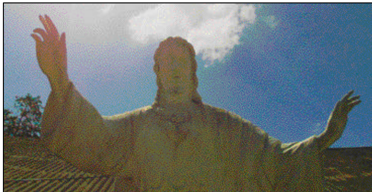
A statue of Jesus Christ stands in front of the Bahay Pag-Ibig Center to give a message of love and hope.