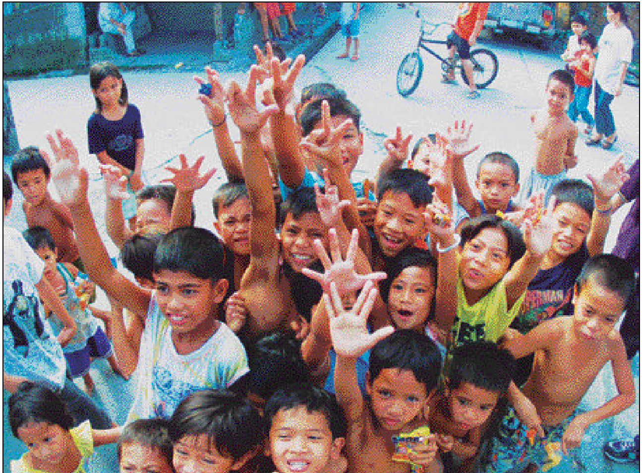
Excited children gather with smiles and waving arms in hopes to grab the attention of visiting Marines and Sailors in front of the church.