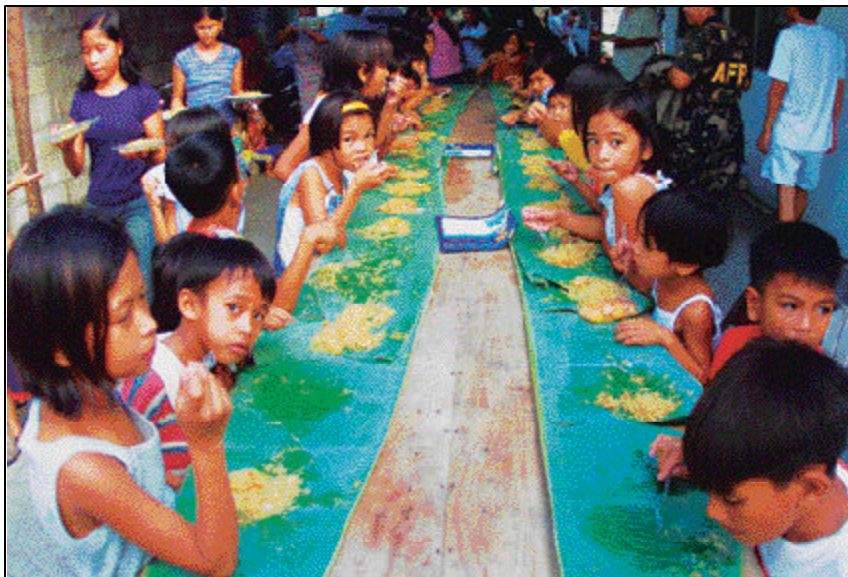
The Sunday school children eat Pansit Bihon (fried noodles) off palm tree leaves after a church service.