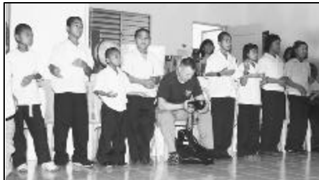
Orphans from the Angeles Bahay Bata Center in Angeles, Philippine Islands, sing a welcome song to the Marines and Sailors visiting the center.

The orphanage houses more than 40 children in a facility that is equipped with restrooms, cafeteria, infirmary, dental clinic, library and a television room.