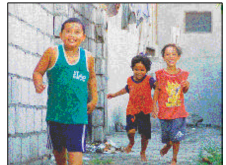
Children from the neighborhood run to get a look at the Marines and Sailors who paid a visit to the church.