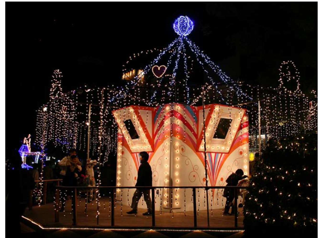
An illuminated carousel attracts children and adults alike in downtown Hiroshima. Many of the Dreamination 2008 displays are interactive and provide photo opportunities and fun for visitors of all ages.