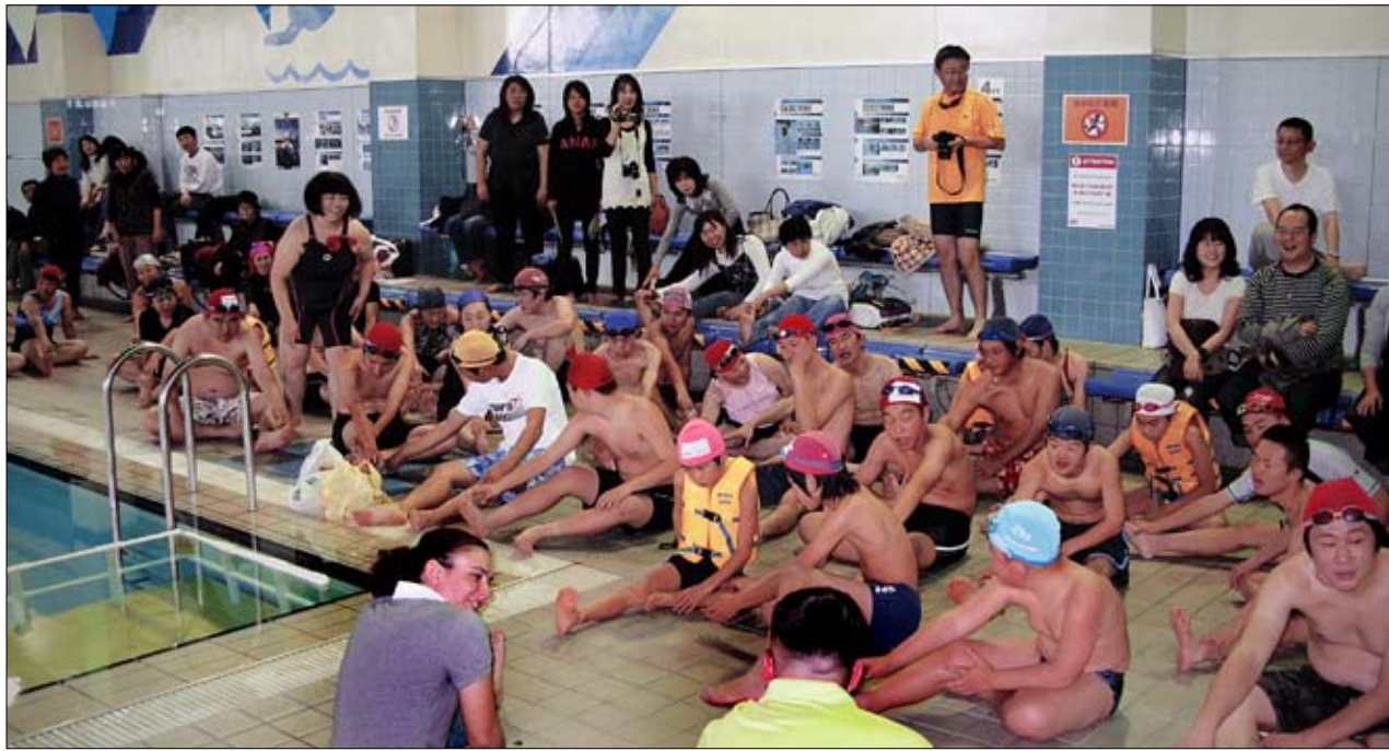
Special Olympics athletes warm up with a stretching routine before getting into the pool during the Special Olympics Hiroshima Sports Day hosted at Ironworks Gym here Nov. 23. Read the full story on page 3.