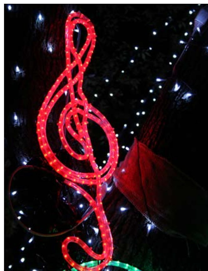
The Dreamination lights feature small intricacies throughout Hiroshima, like this treble clef.