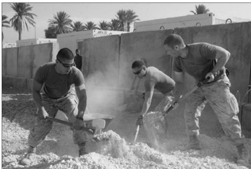
Marines with Regimental Combat Team 1 shovel gravel near their living quarters at Camp Ramadi, Iraq, Nov. 21. With only a couple of months left on their deployment, Marines are trying to put the finishing touches on the improvements to leave their facilities in good shape for incoming units.

But the Marines adapted and quickly began making Camp Ramadi a home away from home, and they plan to leave it better than they found it.