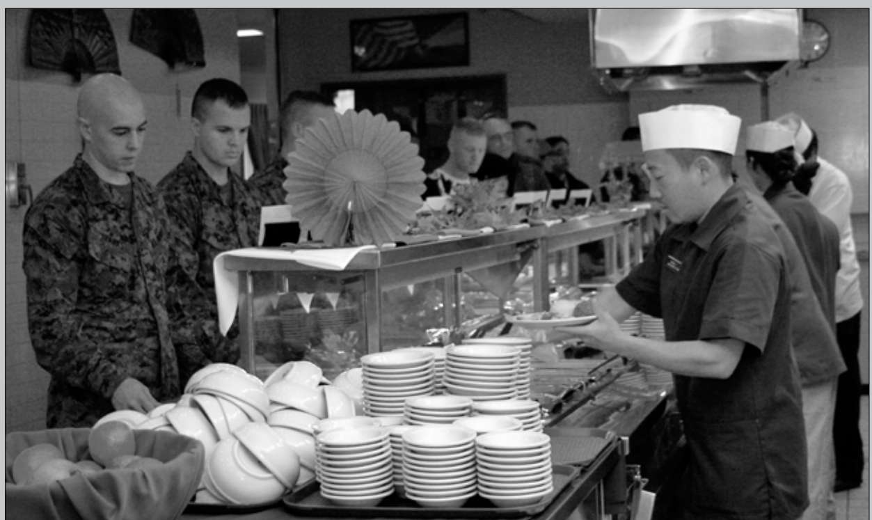
The South-side mess hall opens its serving lines to station residents for a hearty Thanksgiving meal Nov. 27. The lines were flooded with people trying to get a taste of Thanksgiving even when far away from home.

My first year away from home, I bought a 18-inch artificial tree and a three-piece nativity scene. That was the extent of my "Christmas decorating" for many years. I tried to stay away from sentimental holiday music because it only got me down. I'm still not a great fan of it but I realize that it does help many people. I realized many years ago that I could not wait for people to entertain me or to get me out of the holiday funk. I realized that I needed to get off my duff and I needed to be with others. Here are some things I have done, and I encourage you to do the same. Go caroling; invite friends in to watch holiday movies; walk around the base or the city to view and photograph holiday decorations; prepare and share foods which are holiday favorites with neighbors and coworkers; bake cookies as a family or with friends; invite friends to play board games; plan a trip and travel to new places even locally; accept invitations to do things even when you don't "feel" like it. It is not about spending money but enjoying the people in your life. Most importantly, this is a season of renewing our care for one another.