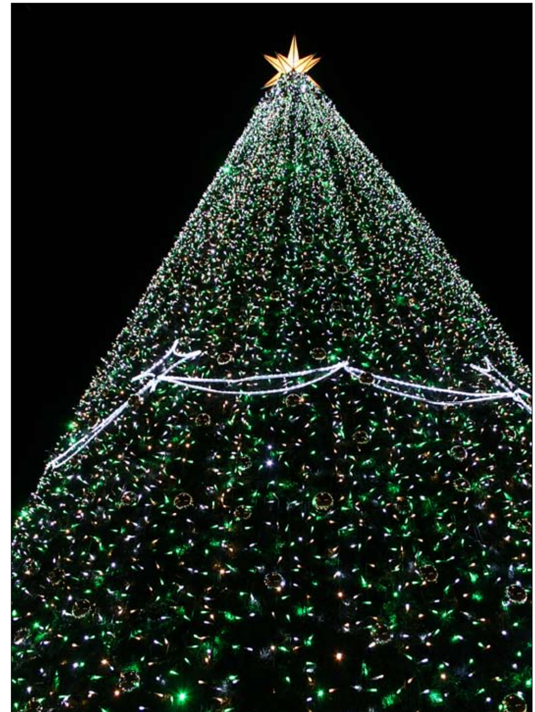
A gigantic Holiday tree accents a restaurant and shopping area in downtown Hiroshima. Large Holiday trees like this are placed throughout the city.