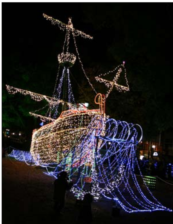
A massive ship riding a glistening wave excites the imaginations of children exploring the Dreamination scenes in Hiroshima.

• For approximately 5,000Y, one can get to Hiroshima, see the lights, eat dinner and have enough yen left over for a cup of coffee and dessert. Just don't forget the camera and liberty buddy — split the cab ride.