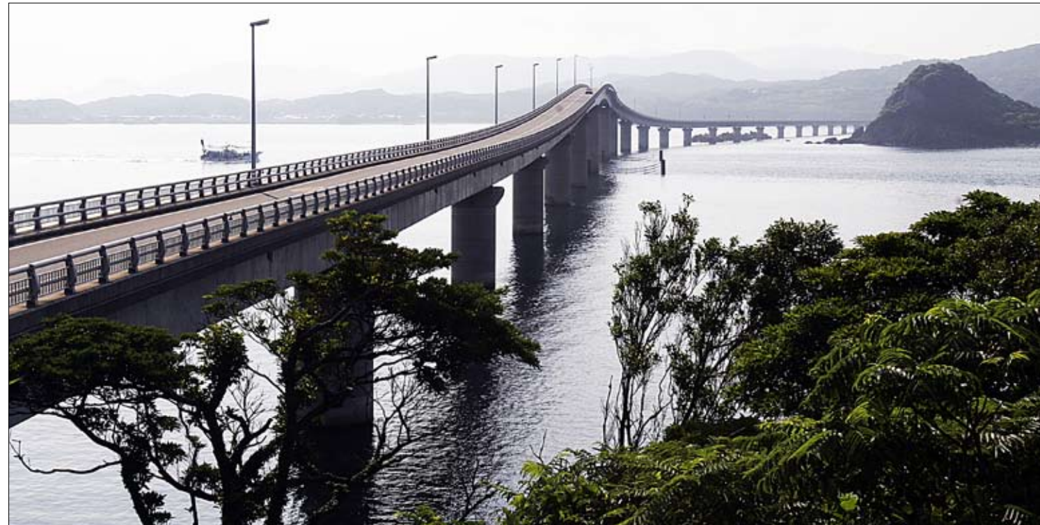
To reach Tsunoshima island visitors must cross the second longest no-toll bridge in Japan. Drivers can park in the turnouts halfway across the bridge to snap photos or take in the view.