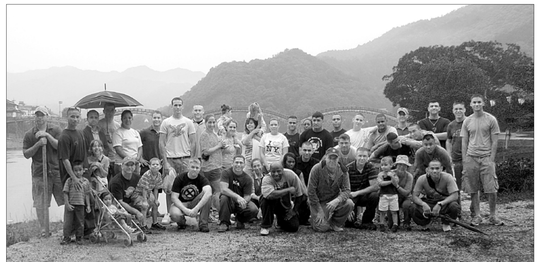
Forty-five Marines, sailors and families from the station gather for a photo after a Kintai Bridge clean-up. Clean-ups like this have been taking place throughout the summer.

No matter what your issue, always ask for advice at the Law Center, but do so with a realistic expectation that a limited number of issues cannot be solved here on base.