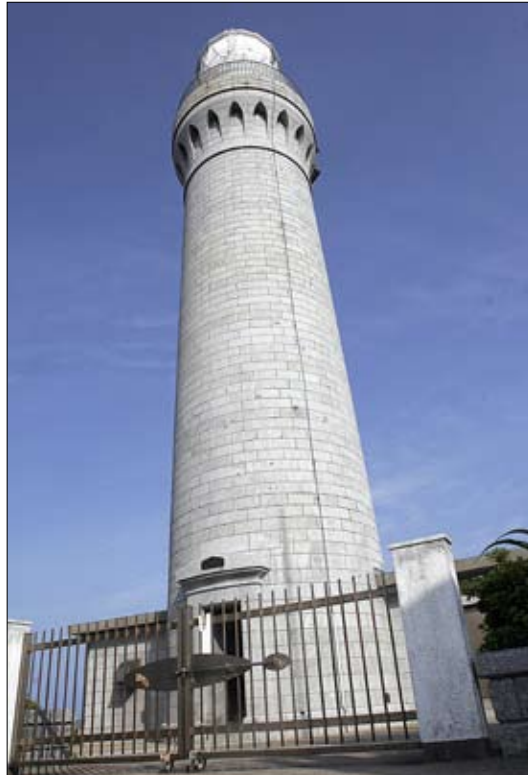
Designated a cultural asset by Shimonoseki City, the Tsunoshima lighthouse has been guiding ships for over 130 years. For a small fee visitors are welcome to enjoy the view from the top of the 141-foot landmark.