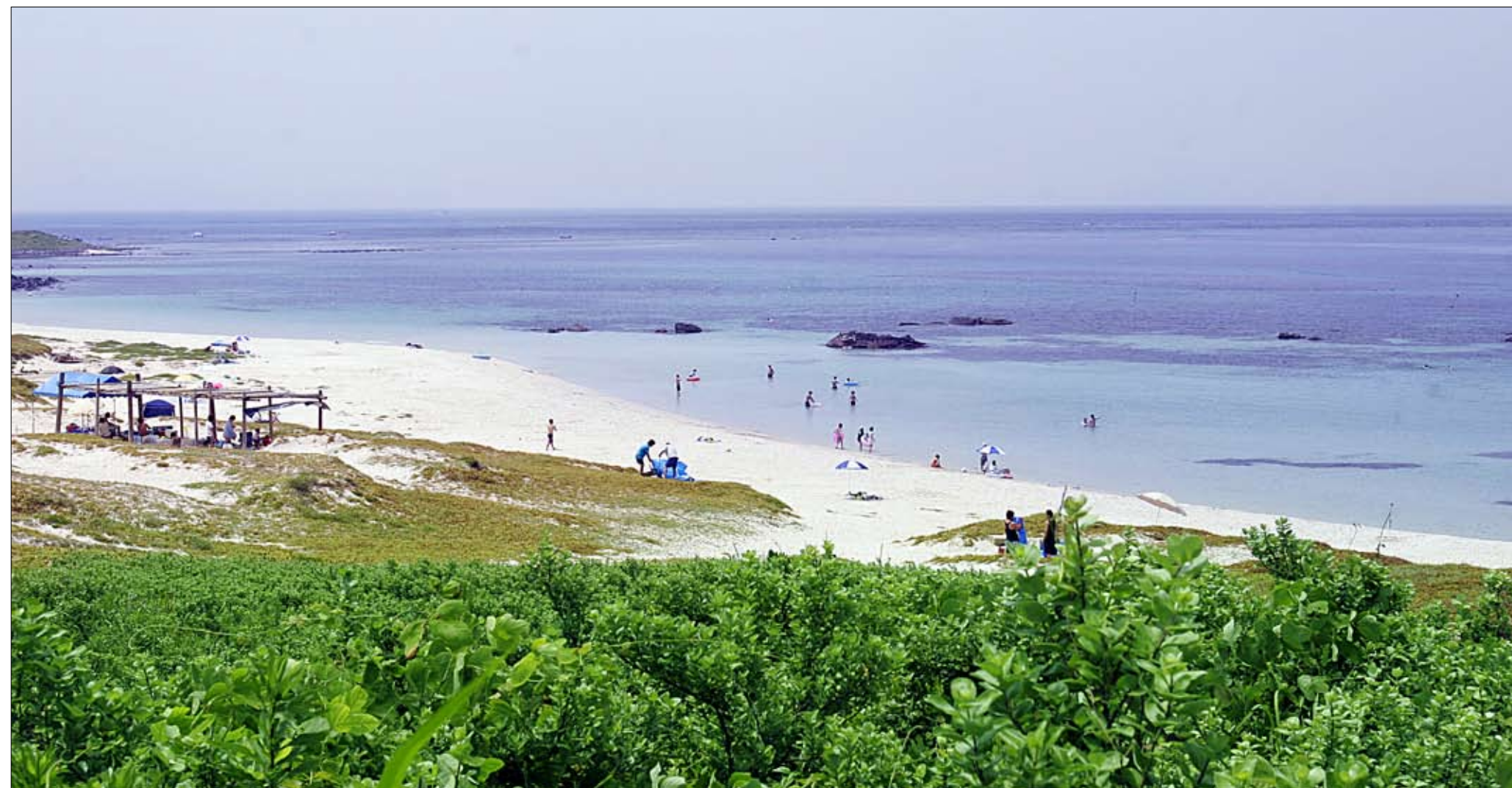
Camp sites at Kita Nagto Coast quasi-national park are a perfect vantage point for taking in the scenery of Ohama Beach.