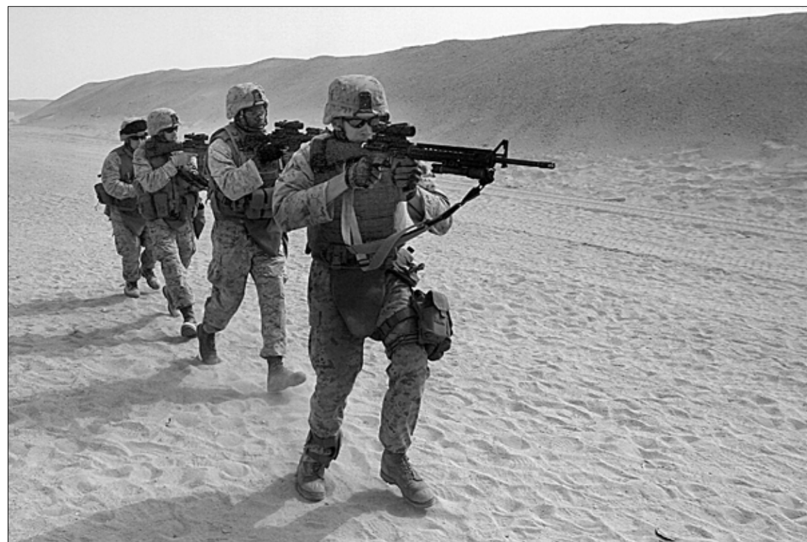
Light Armored Vehicle Scouts with Weapons Company, Battalion Landing Team 2/5, 15th Marine Expeditionary Unit, advance toward an objective during a live fire Military Operations in Urban Terrain exercise in Northern Kuwait. Weapons Company came ashore to Kuwait in late June to conduct sustainment training, ensuring vital war fighting skills are not lost. Kuwait provides open space for the company to practice combat driving skills and ranges to conduct live fire exercises. The Camp Pendleton, Calif. based 15th MEU is comprised of approximately 2,200 Marines and Sailors and is a forward deployed force of readiness capable of conducting numerous operations, such as Non-combatant Evacuation Operations, Humanitarian Assistance Operations and a wide range of amphibious missions. The 15th MEU is currently conducting sustainment training in Kuwait.