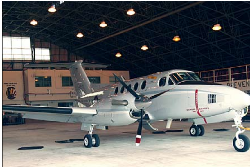
The C-12 transporter aircraft is a seven-passenger plane capable of carrying its contents around the world. Headquarters and Headquarters Squadron C-12 Operations is currently looking for air crew chiefs to assist the pilot in maintaining the wellness of passengers and aircraft cargo.