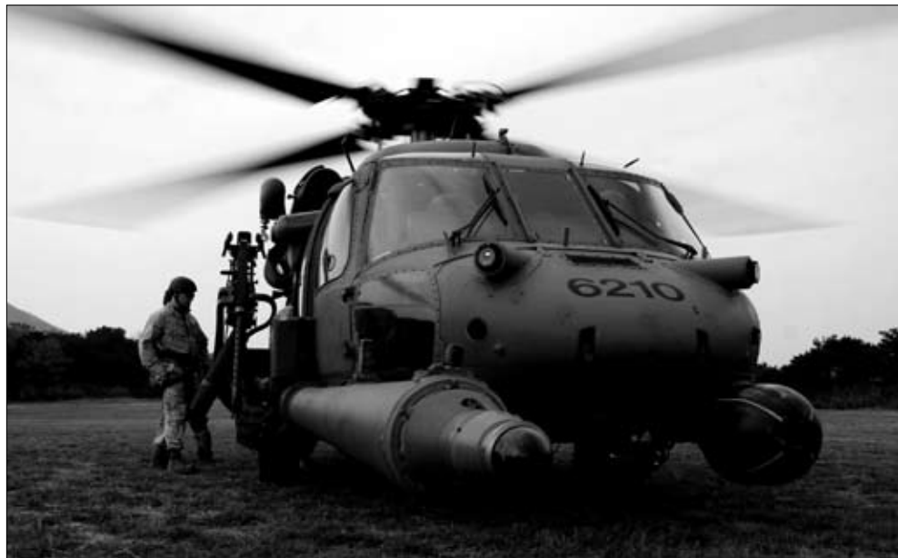
(Above & Below) Marines with III Marine Expeditionary Force's Special Operations Training Group conducted joint training with an Air Force Pavehawk helicopter and crew in the Central Training Area Feb. 21. The Air Force crew helped the SOTG Marines qualify to oversee helicopter rope suspension techniques training and operations using the aircraft.