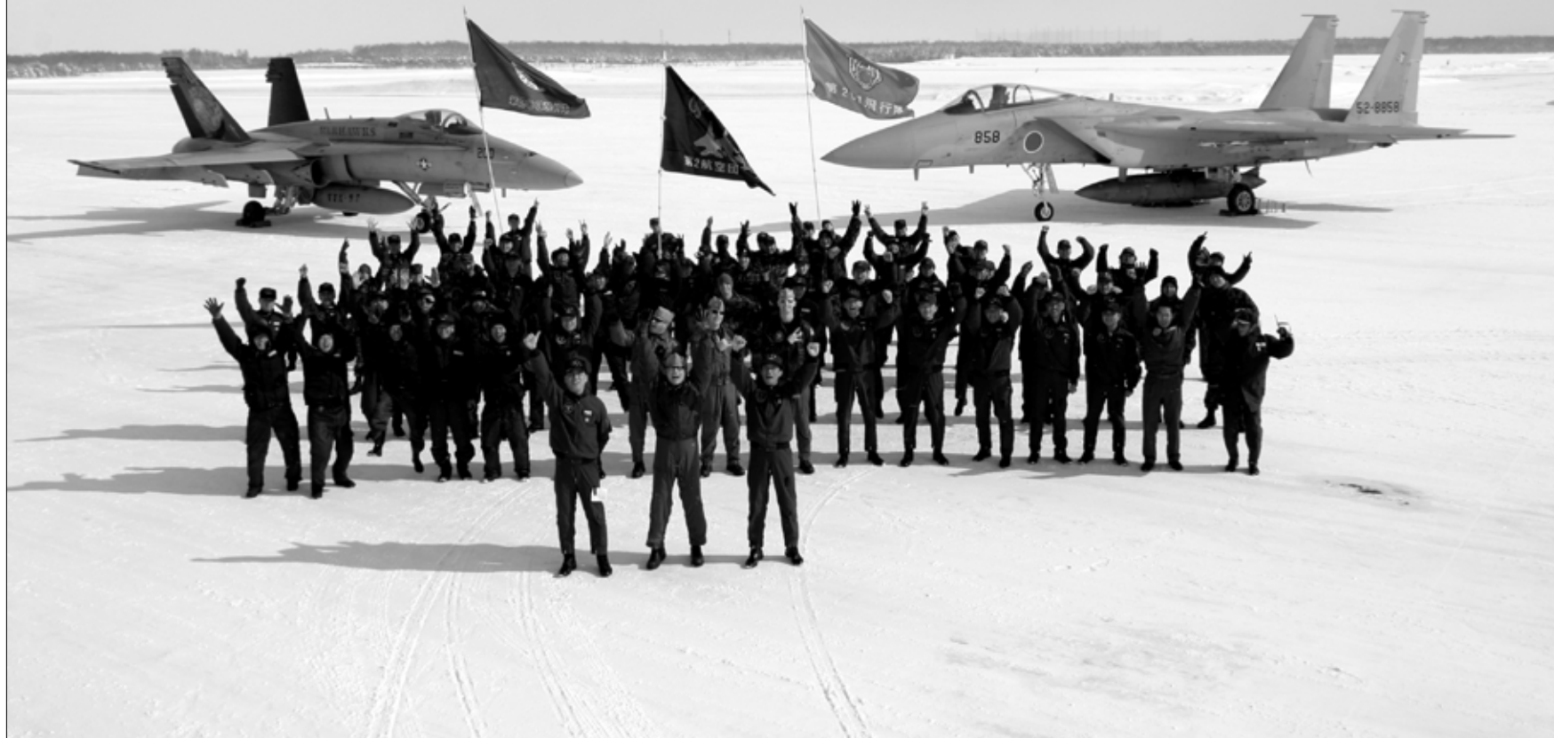
Strike Fighter Squadron 97 personnel along with Japanese Air Self-Defense Force 201st and 203rd Tactical Fighter Squadron personnel celebrate their successful completion of two Aviation Training Relocation (ATR) detachments at Chitose Air Base.