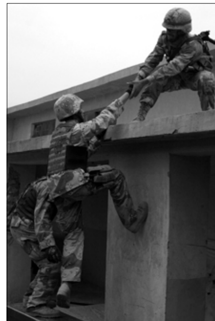
Iraqi Army soldiers work together getting on a roof to fix windows and clear debris from a school in Al Tuzliyah, Iraq, Friday. Iraqi Army soldiers from 3rd Battalion, 3rd Brigade, partnered with the Marines and sailors of Company I, 3rd Battalion, 2nd Marine Regiment, Regimental Combat Team 5, renovated the entire school from top to bottom to provide the children with a school they could be proud of.