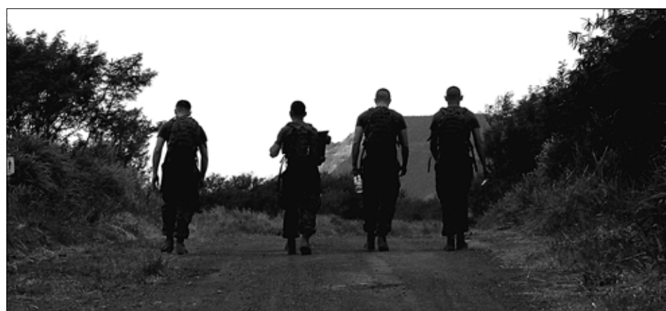
Marines from Marine Aircraft Group 12 experience the trek to Mt. Suribachi during a Feb. 26 professional military education trip to Iwo Jima Island.