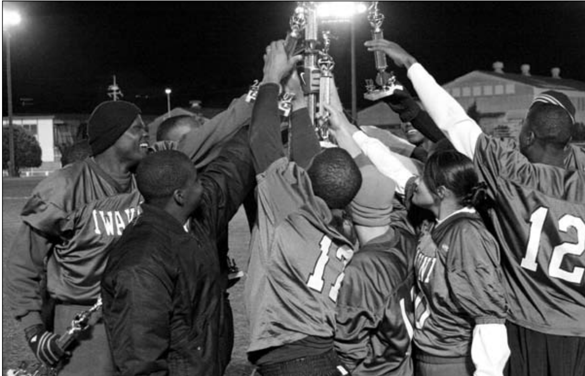
The Headquarters and Headquarters Squadron Liberty Risk celebrates after its 18-6 victory over Combat Logistics Company 36 in the intramural football championship game at Northside field here Wednesday.