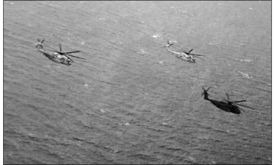
A Vulcan 546 leads Griffins 23 and 25 in a historic first formation flight between the U.S. and Japan.

On the final day available for the flight, the four aircraft turned up on time and were ready to head out. For almost two hours, both HM-111 and HM-14 got a chance to lead the flight and take pictures. Though rain threat-