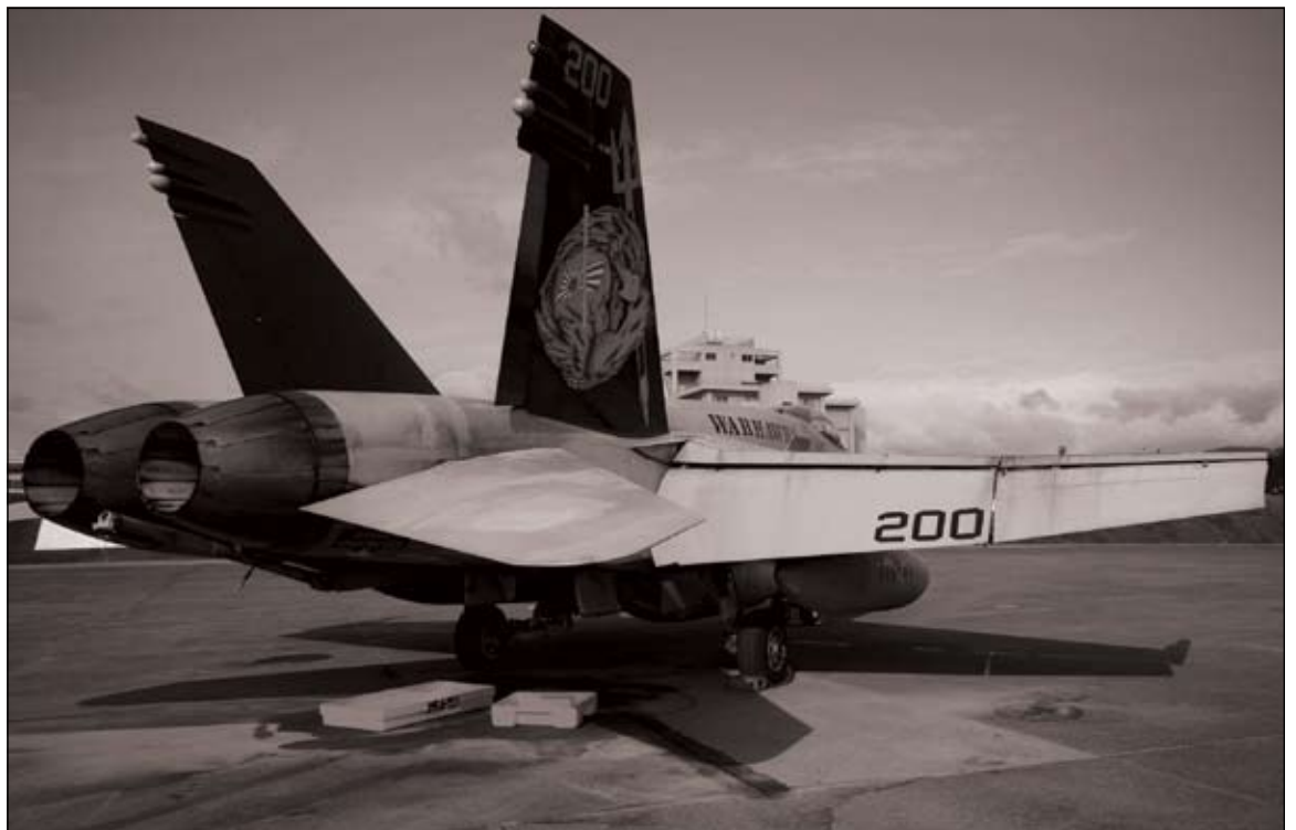
An F/A-18C fighter jet belonging to Navy Strike Fighter Squadron 97 (VFA-97) is distinguishable by its custom "Warhawk" paint job - with an American flag-bearing hawk on its left tail wing and a Japanese flag-bearing hawk on its other. The squadron is here for a six-month deployment.