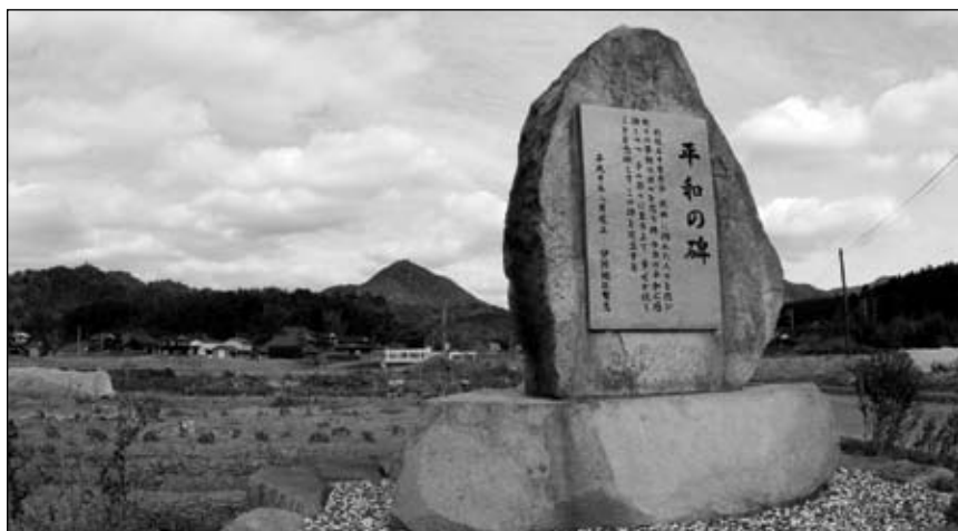
The memorial placed in tribute of the Lonesome Lady, a B-24 bomber shot down near Yanai City, can be found in the small farm community of Ikachi. Five Lonesome Lady crew members were later interned at the Chugoku Military Headquarters in Hiroshima at the time of the atomic blast.