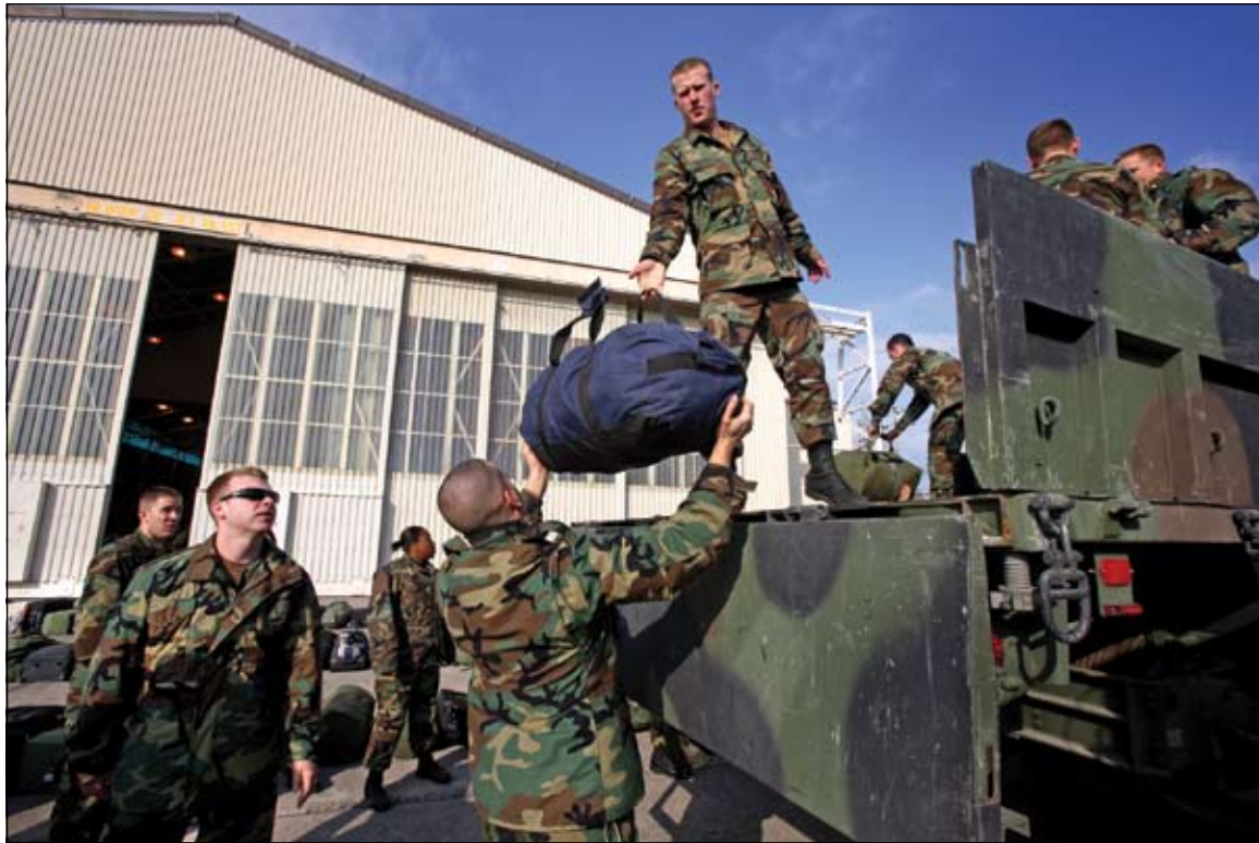
Members from Navy Strike Fighter Squadron 97 unload equipment and personal belongings from a 7-ton vehicle shortly after their arrival here Jan. 16. The Naval Air Station Lemoore, Calif.-based squadron is here for a six-month deployment in support of Marine Aircraft Group 12.