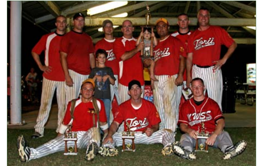
Team Torii takes first place at the Chili Slip-N-Slide Softball Competition at Penny Lake Field here Saturday. Six teams participated in the all-day competition.

Once the competition came to an end, both teams held informal ceremonies, handing out trophies to each player, courtesy of Marine Corps Community Services.