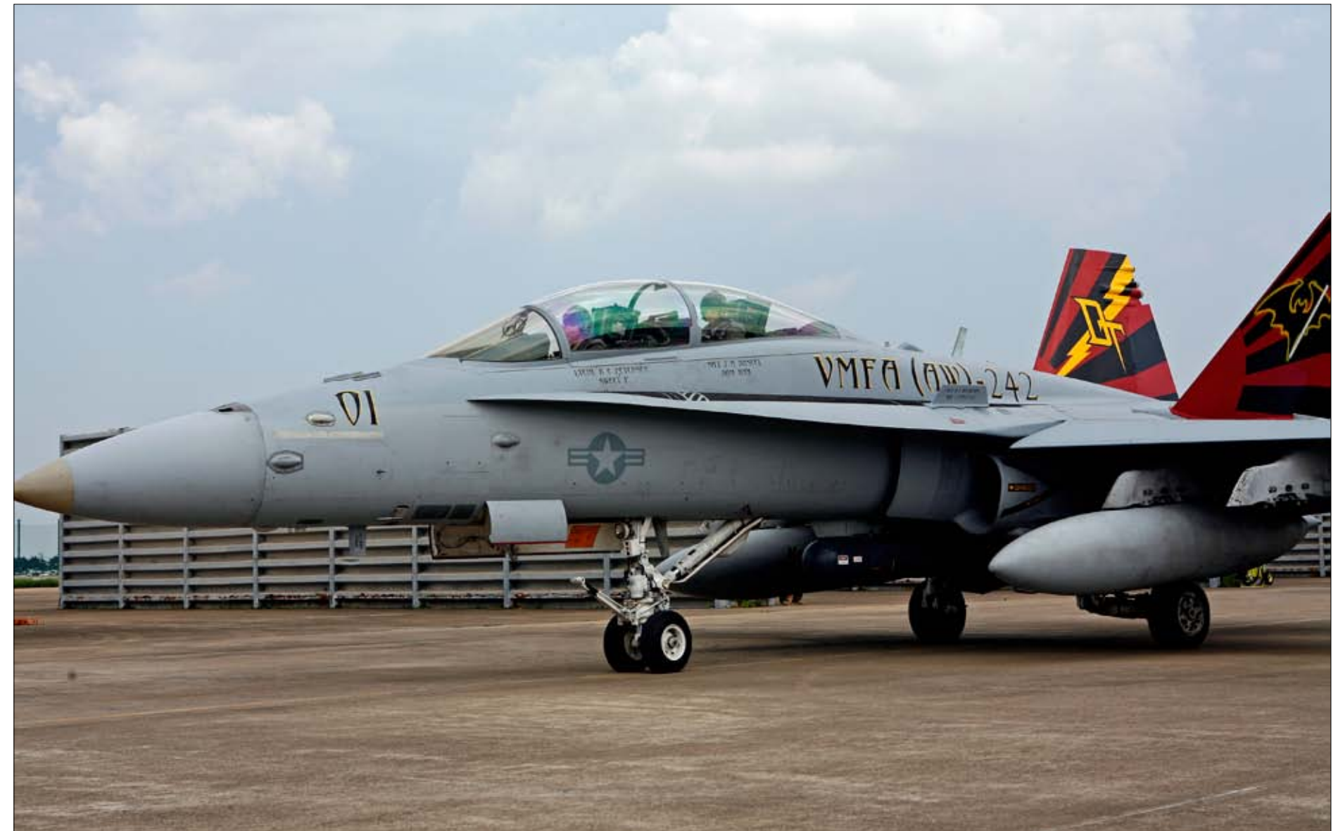
POHANG AIR BASE, Republic of Korea – Marine All-Weather Fighter Attack Squadron 242's flag plane is taxied in preparation for a sortie during exercise Invincible Spirit here July 27. Invincible Spirit was a joint combined exercise where the Navy, Air Force, Marine Corps and Republic of Korea forces worked together to demonstrate solidarity and a commitment to work together.

By conducting exercises with various countries and keeping good relationships with its host country, MAG-12 has purposefully positioned itself in a constant stance of readiness for today and tomorrow.