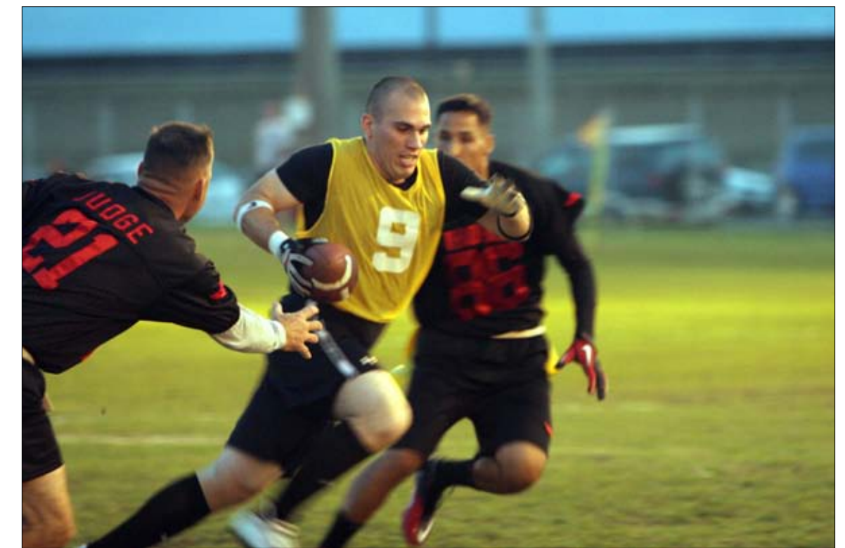
IYAOYAS players attempt to take down an elusive Five-O player during the third-place game for the preseason Intramural Flag Football Tournament at the Penny Lake fields here Sept. 28. Five-O went on to lose in the championship to the All Stars 33-12.

Regular season flag football begins Oct. 18.