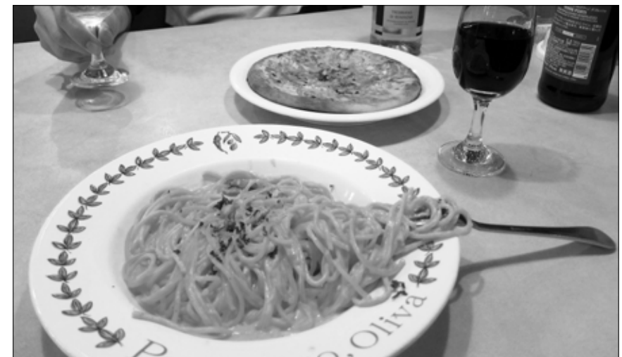
The pizza and pasta at Fracasso in Iwakuni. The restaurant offers an assortment of pizzas and pastas, each with a unique flavor and cheaply priced; each plate is approximately ¥550.

Fracasso is located in Iwakuni near You Me town at 1-15-45 Minami-Iwakuni Cho, Iwakuni Shi. Although the atmosphere resembles that of a family diner, the tastes they offer are Italian. Its menu has a full range of flavorful steaks, pastas, pizzas, sandwiches and deserts. Its savory pastas and personal-sized pizzas will catch you off guard as your tongue encounters the full flavors their seasons and spices have. The restaurant offers large portions at a cheap price. Prices range from approximately ¥500 to ¥1,000 per dish. Well lit and with non-smoking and smoking seating, it's the perfect place for a family meal or a gathering with friends.