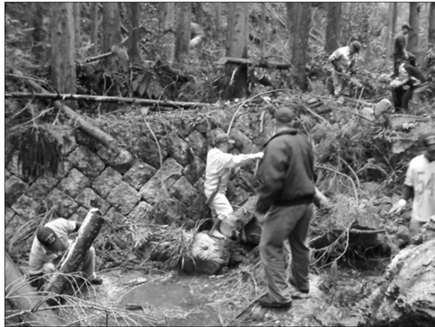
Six Japanese volunteers led by Katsuhiko Fujimori used chain saws to cut the trees blocking the flow of the Nagatani Mountain Stream during a community relations project March 1. The USS Rentz sailors then removed the trees.

Most community relations projects, whether they involve cleaning up a stream; painting a building; or visiting orphanages, schools and hospitals; help foreign countries like our