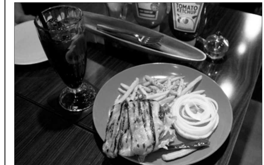
The bacon cheeseburger at Upper Café Diner New York, New York in Hiroshima. With a simple presentation, it surprises the senses with a savory taste you'll think about well after you finish.

You can find the Upper Café Diner New York, New York within the Hiroshima Namiki-dori shopping streets at 7-2 Fukuromachi Naka-Ku. Anyone who's been to New York will feel the city's vibe within this small open-spaced café. Although their bilingual menu changes from time to time, it's filled with a variety of salads, appetizers, pastas, meats, pizzas and desserts. You can also count on finding that full-flavored American gourmet burger you've been looking for. The American-like flavors and lively music beats in the background will take you back to New York City. With good-sized portions, the prices are on par with the taste and friendly service staff. Prices range from approximately ¥1,000 to ¥1,500 per dish. There is no non-smoking area.