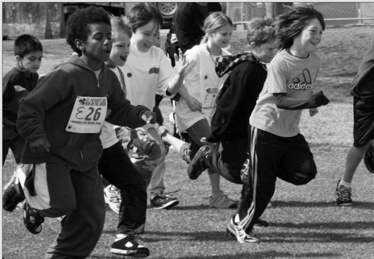
Youth participants take off from the starting line during the 2009 St. Patrick's Day "Run on the Green" March 14 at the Torii Pines Golf Course here. The youth course was 2.5 kilometers and the adult course was 5 kilometers. The "Run on the Green" was sponsored by Marine Corps Community Services. This year's "Run on the Green" is scheduled to take place Saturday. Check-in starts at 8 a.m. The 2K run for youth and teens will begin at 9 a.m., and the 5K run for adults will start at 9:30 a.m. For more information, call 253-5654.