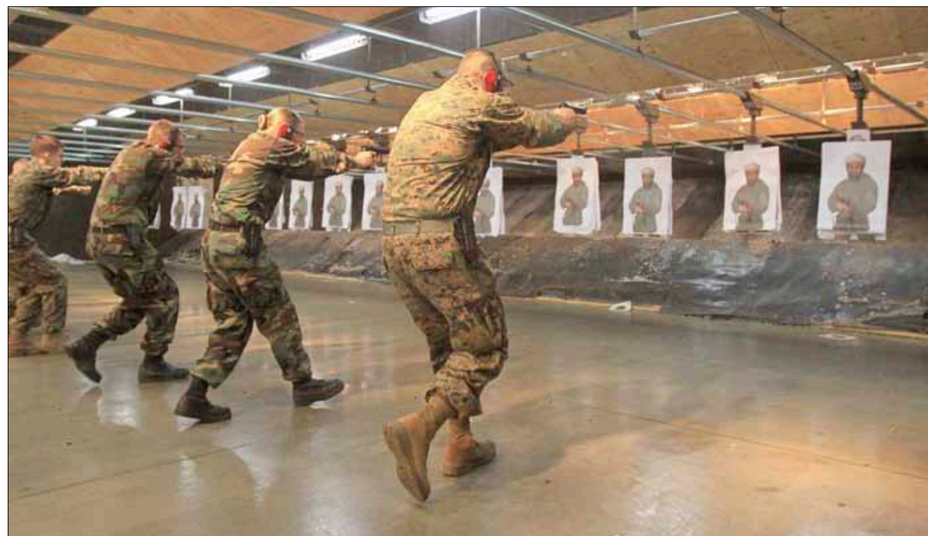
Marines and sailors shoot pictures of Osama bin Laden during the Wolf-Tactical Reconnaissance and Personal Protection training at the Indoor Small-Arms Range here Jan 21. Wolf-Tactical Reconnaissance and Personal Protection is better known as WOLF T.R.A.P.P.