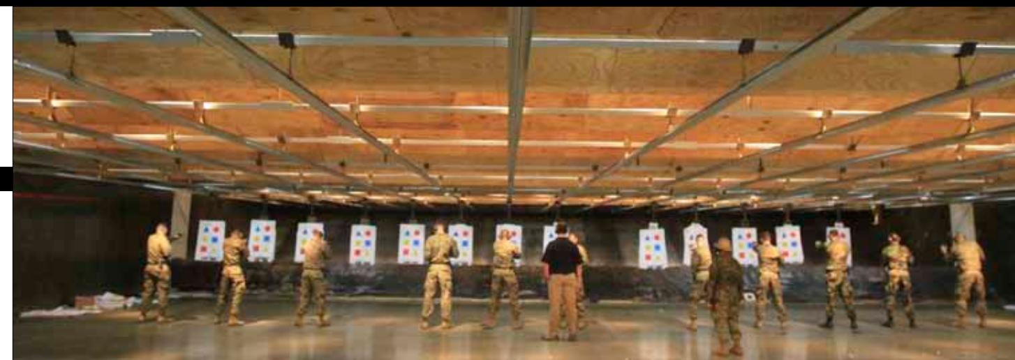
Marines and sailors stand in line during the Wolf-Tactical Reconnaissance and Personal Protection training at the Indoor Small-Arms Range here Jan 21. This past December, ISAR hosted a two week long training exercise with former members of the Israeli Special Forces. There will be more training opportunities at ISAR throughout the year.