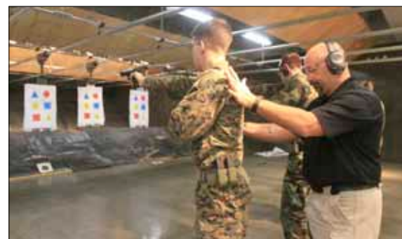
An instructor repositions a Marine's stance during the Wolf-Tactical Reconnaissance and Personal Protection training at the Indoor Small-Arms Range here Jan 21.