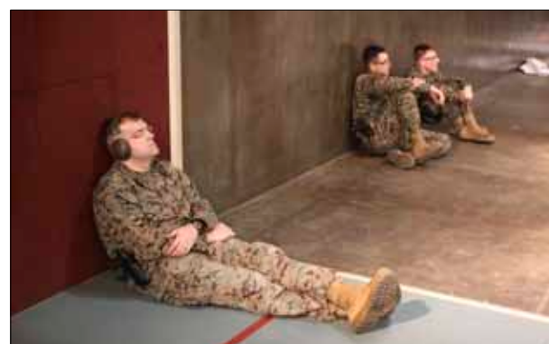
A Marine takes a quick nap during the Wolf-Tactical Reconnaissance and Personal Protection training at the Indoor Small-Arms Range here, Jan 21. Service members spent two weeks on the range constantly firing pistols.