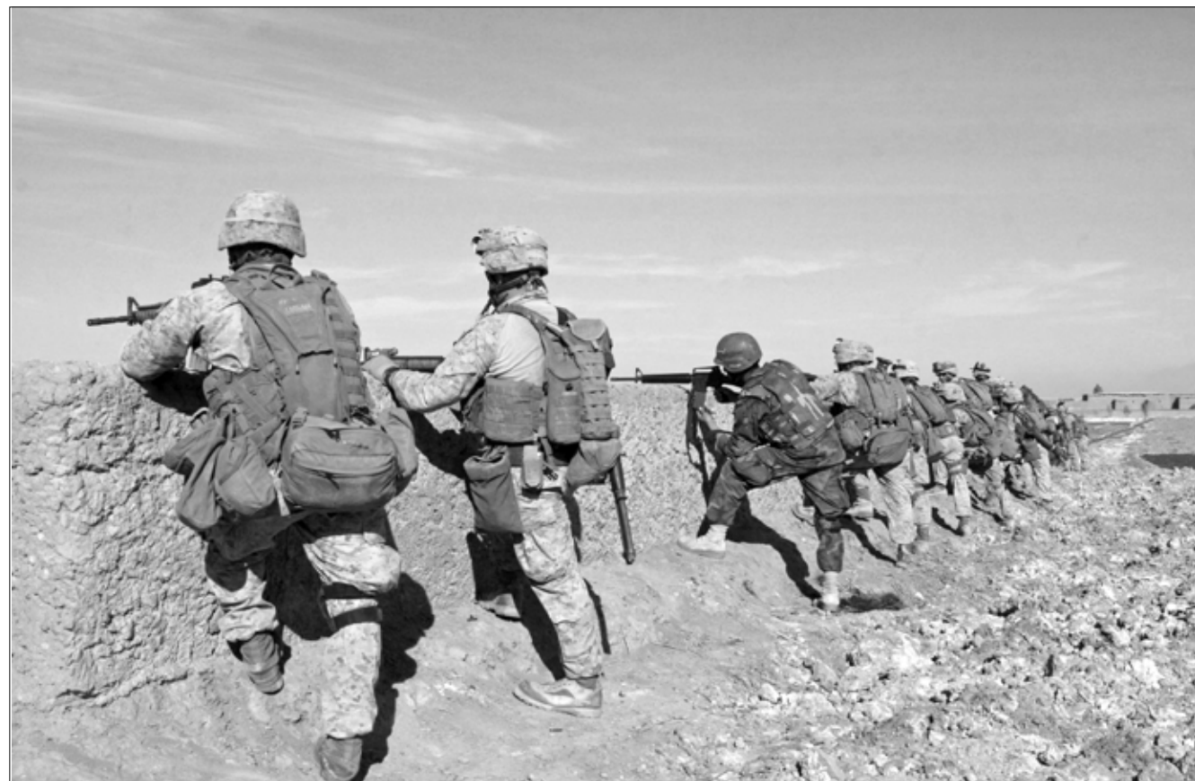
HELMAND PROVINCE, Islamic Republic of Afghanistan — Marines and Afghan National Army soldiers with Alpha Company, 1st Battalion, 6th Marine Regiment take cover behind a wall after being fired upon by insurgents during a patrol in Helmand province, Jan. 18.

For the next five hours, Marines and ANA soldiers traded fire with insurgents. The sun had set by the time the patrol withdrew, and