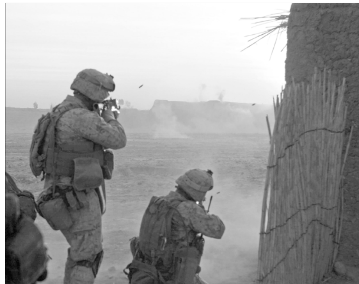
LANCE CPL. JAMES CLARK

With the events of the day behind them and the HME ingredients destroyed, the patrol set off towards their camp to catch a few hours of rest before going out again the following morning.