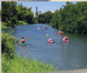
Kayakers enjoy a day on the Hanalei River.