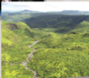
A sophisticated computer model being tested in mountainous terrain will help prioritize measures to reduce turbidity.