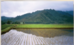
Changes in taro cultivation will reduce sediments and other pollutants.