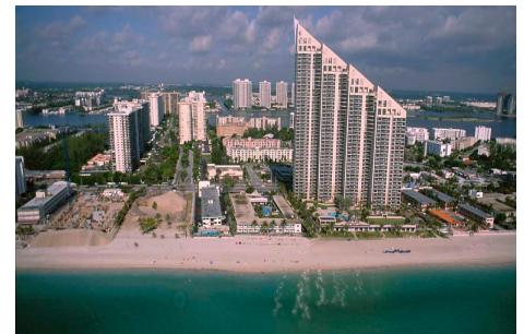
Above: Coastal barriers are attractive—but risky—places to build.