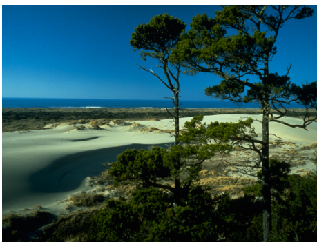
Above: Coastal barriers are important for migratory birds and many at-risk plants and animals.

Keeps people out of harm's way by discouraging construction in risky areas where hurricanes strike first.