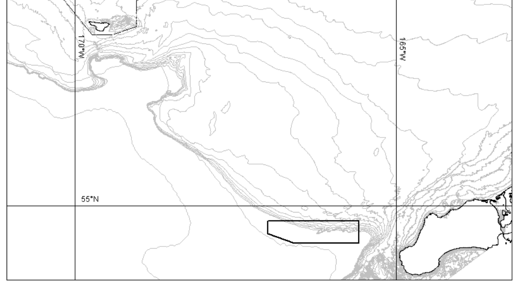
Exhibit A. Chinook Salmon Conservation Area

Entered into as of the date first set forth above.