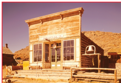
Smith-Sherlock Store - South Pass City, WY