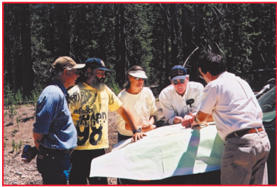
Medicine Lake, CA

Section 106 of the National Historic Preservation Act requires Federal agencies to consider the effects of their actions on historic properties. It is a powerful tool that ensures private citizens and State and local governments have a voice in Federal decisions that impact historic properties. Under the process: