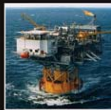
Morpeth SeaStar® TLP