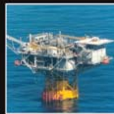
Allegheny SeaStar® TLP