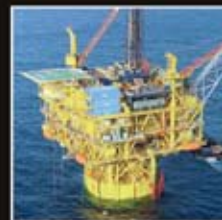
Matterhorn SeaStar® TLP