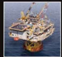
Typhoon SeaStar® TLP