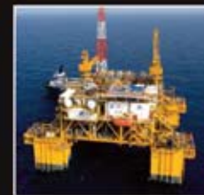
Independence Hub DeepDraft Semi®