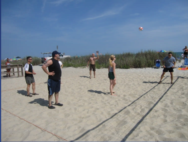
A volleyball game at our annual retreat!