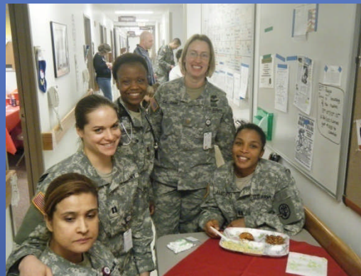
Contact us for a rotation