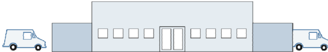
Mail Processing Facility