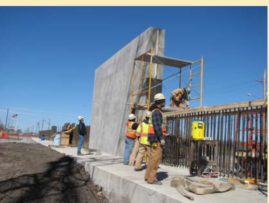
Harvey Canal Floodwall

Inner Harbor Navigation Canal Surge Barrier