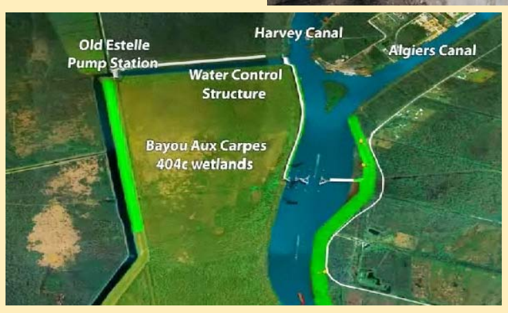
GIWW-West Closure Complex pile test