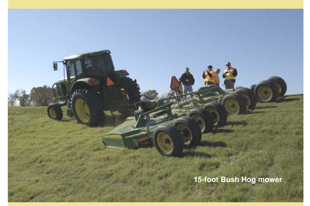
Levee board tractors mow the grass at the levee test site in St. Charles Parish as test team members closely observe the work and take notes.