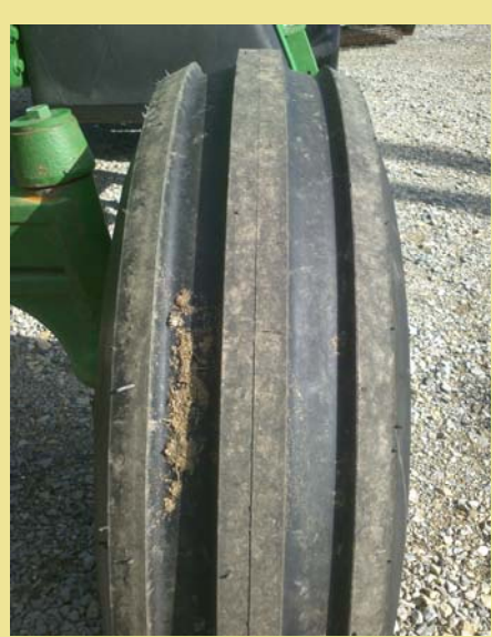
Ribbed Agriculture Tire

high after two months of growing. The advantage here is that the levee boards will not have to mow the levees as often as they presently do. That is expected to result in lower maintenance costs.