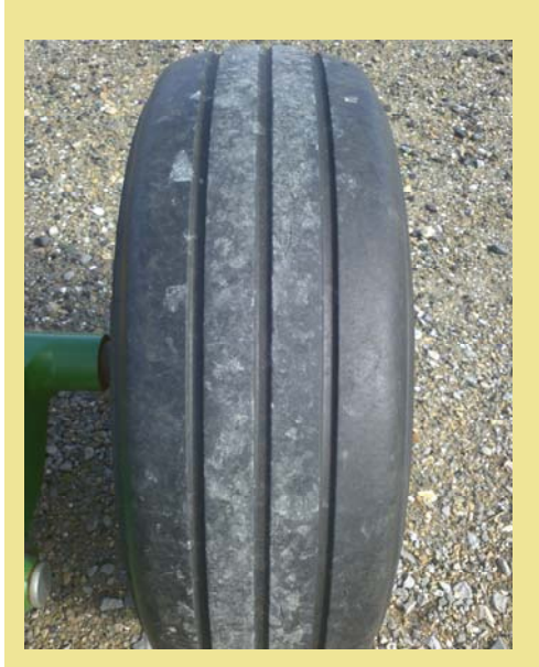
Turf Flotation Tire