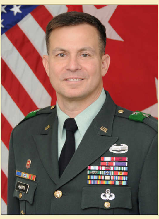
Maj. Gen. John W. Peabody

We who are entrusted with managing the heartland of this system have a sacred duty to apply our best efforts - all of our intellectual and physical energy - to ensure this natural and national treasure delivers the greatest value, in both economic leverage and natural heritage, as is possible. I pledge to apply all of my energy and abilities to work with you to achieve precisely that purpose.