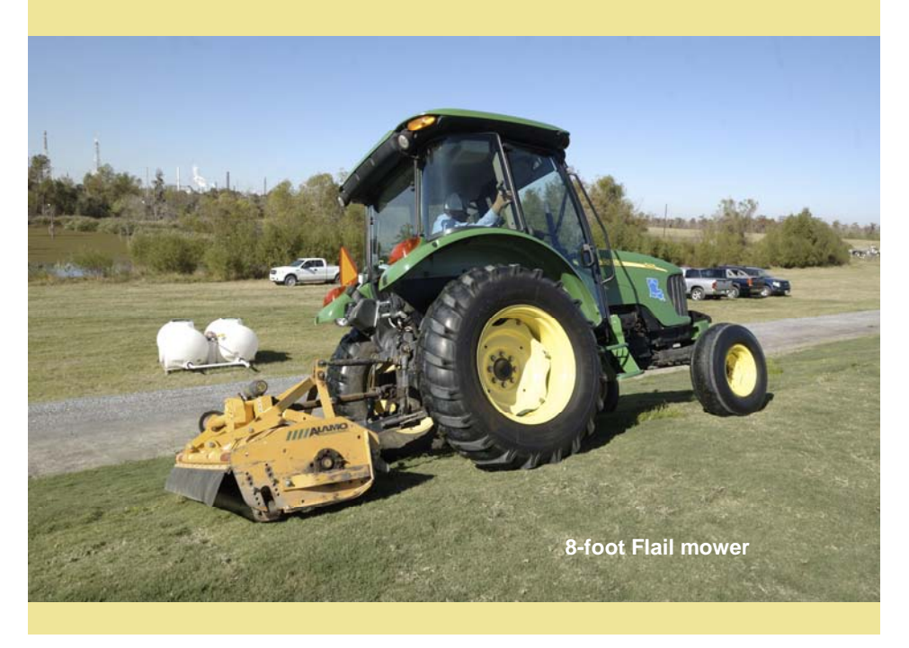
Continued from page 1

of the Hurricane and Storm Damage Risk Reduction System (HSDRRS). Armoring provides the extra resilience a levee would need to withstand the possibility of overtopping from a storm surge greater than a 100-year storm.