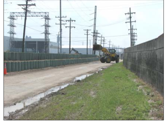
TOP: HESCO baskets are placed at the IHNC west wall prior to Gustav to reduce risk of flooding. RIGHT: (Post-Gustav) HESCO baskets did their job!