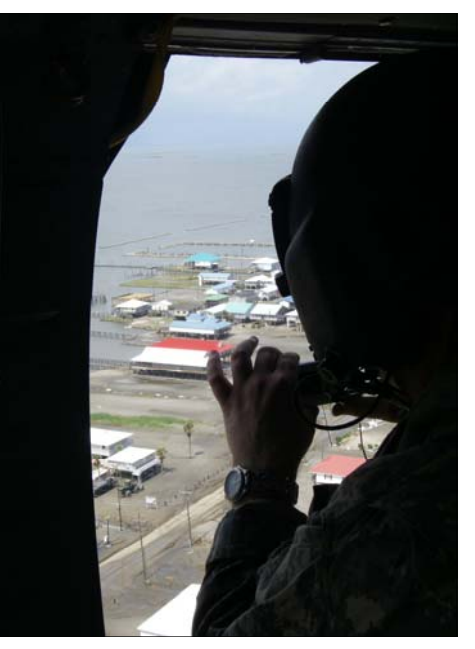
Aerial inspections are an important part of the Corps' assessment process.

6. As additional risk reduction measures, although no damage occurred, 18 transitional areas will be armored. These are areas where a concrete structure meets an earthen structure. Nine of these areas are along the IHNC floodwall, and nine areas are along the lake-