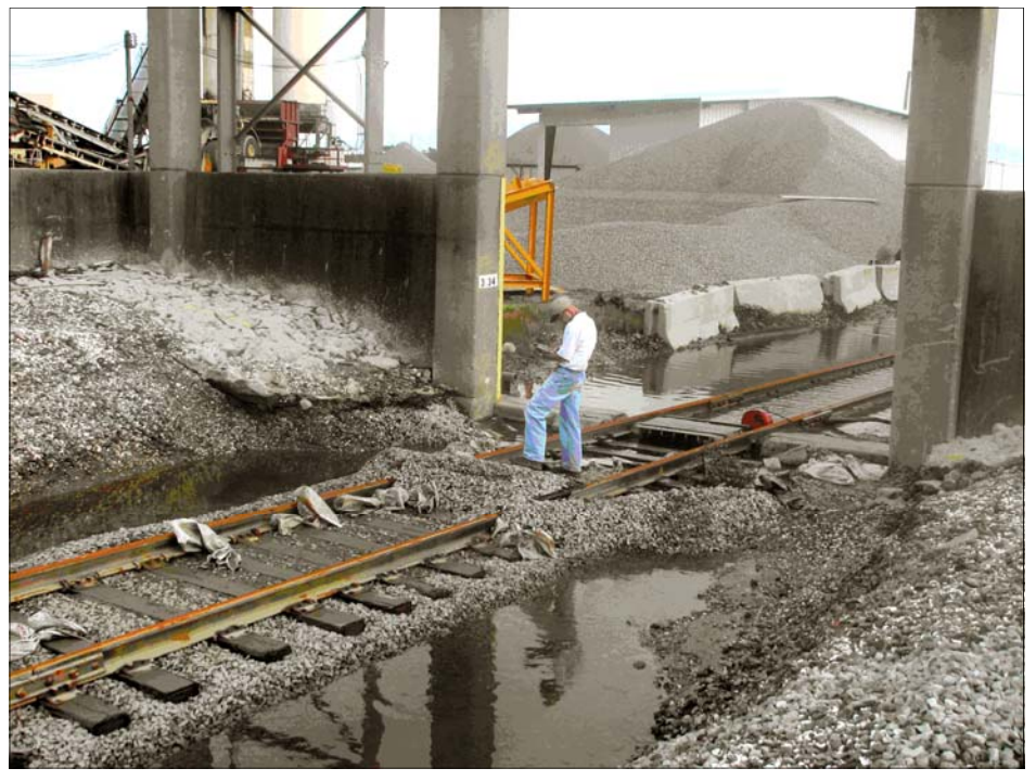
A Corps technician inspects a railroad gate along the HSDRRS that had some damage during Hurricane Gustav.