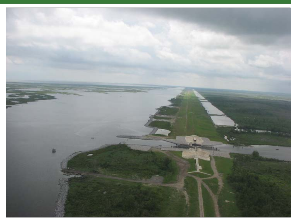
The Mississippi River Gulf Outlet (above) was officially de-authorized on June 5 when the Corps of Engineers Chief's Report was forwarded to Congress. A rock closure will be built near Bayou La Loutre to permanently seal the channel.

The report recommends the construction of a closure structure just south of Bayou La Loutre near Hopedale, La., at full Federal expense; and further recommends the state provide lands, easements and rights of way as well as the operation and maintenance responsibilities of the