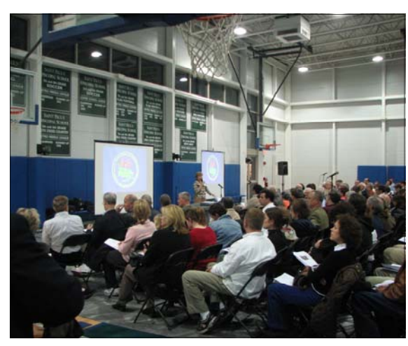
Public meeting on Feb. 26

"Feedback provided to the Corps at public meetings is taken seriously and is considered when the Corps makes a decision on projects," said Gib