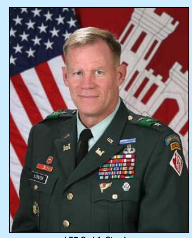
LTG Carl A. Strock

We recognize that we're important not only to the physical recovery of the area, but also to the economic recovery of the area. So throughout, we have emphasized that we want to employ local con-