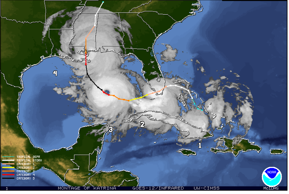
In 2005, Hurricane Katrina marched across the Gulf of Mexico, finally making landfall on the coasts of Mississippi and Louisiana.

sippi Valley Division, in conjunction with other federal, state and local partners, has continued an unprecedented, multi-faceted effort to assist