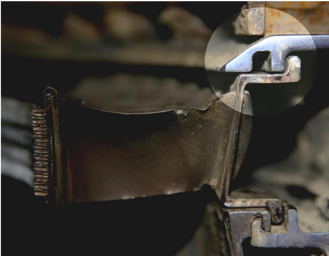
Incorrectly Installed Stator Vane Sector