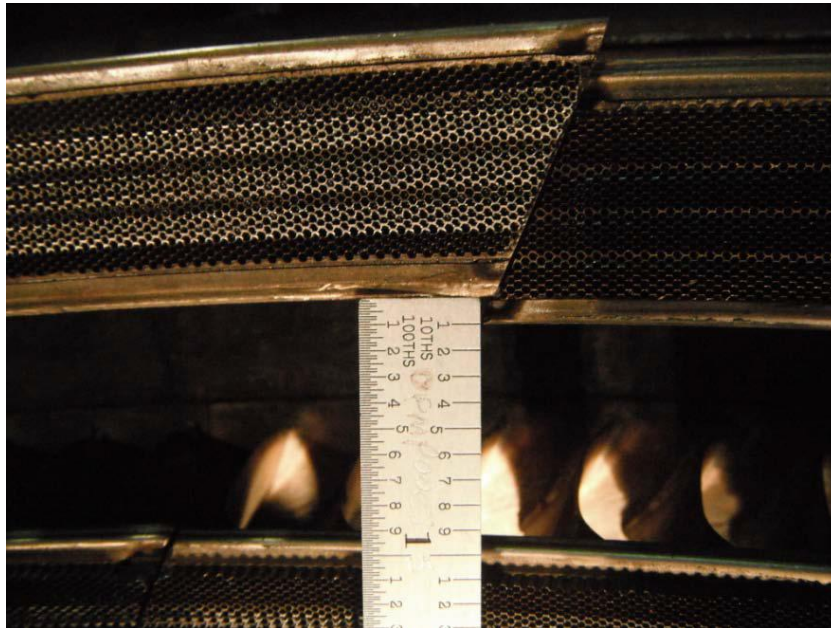
Offset vane sector extending forward 0.1 inch (Tab J-26)

All stage 5 vanes showed significant damage on both the leading and trailing edges (Tab J-26).