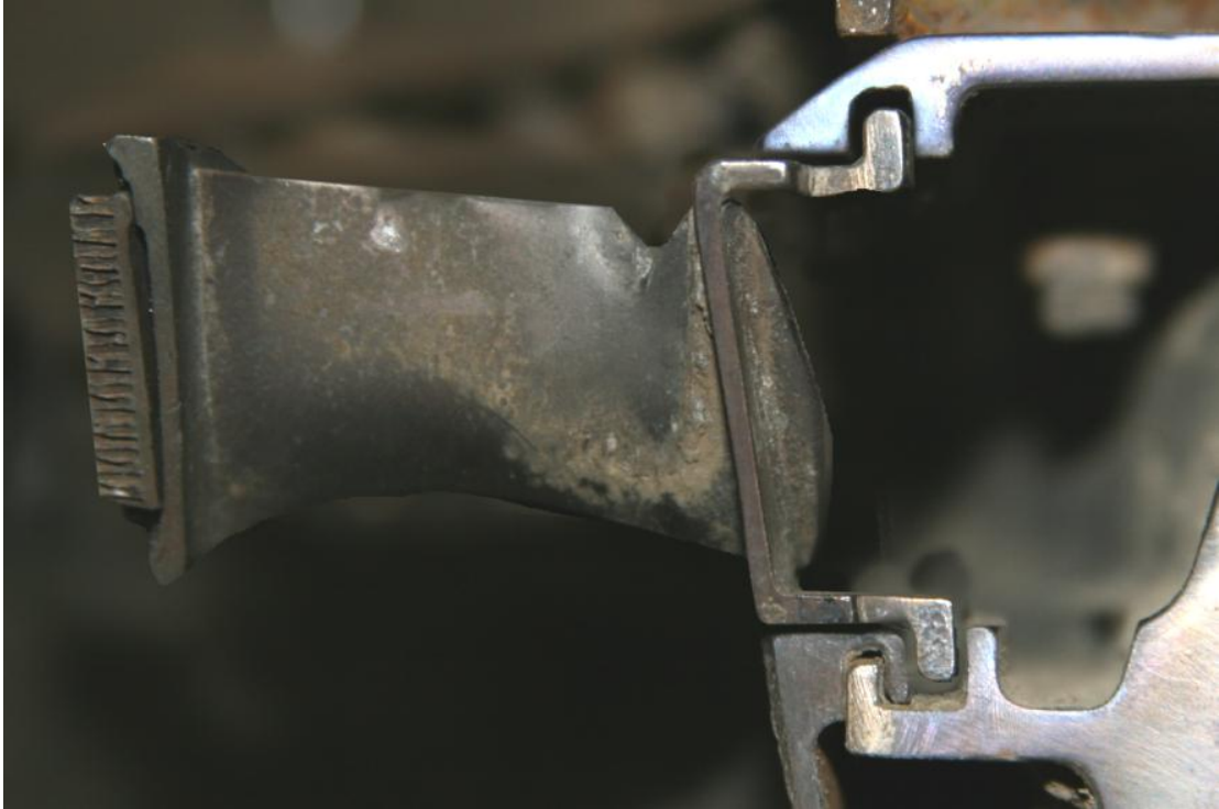
Correctly Installed Stator Vane Sector