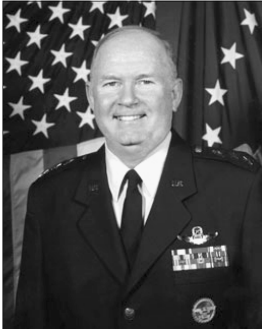
Lt. Gen. James E. Sherrard III

AFRC members have sustained serious injuries and we have had extensive equipment damages as the result of aircraft taxi accidents, cargo loading accidents, and failure to follow established flight operations procedures. In each case, these