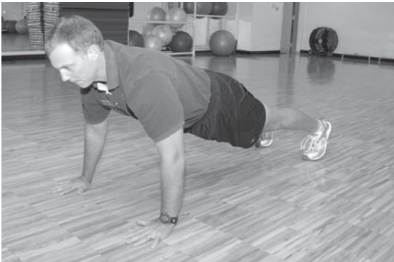
The push-up begins with the feet about a foot apart, hands and face forward and back straight.