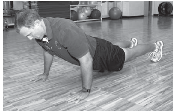
Dropping the hip down is another approved rest position during push-ups, as long as the body does not go all the way down.

units,” DeCoux said. “Base fitness centers can provide ... the equipment and guidance needed to carry out those fitness programs. Additionally, we have fitness experts in the centers to help individuals train, one-on-one.”