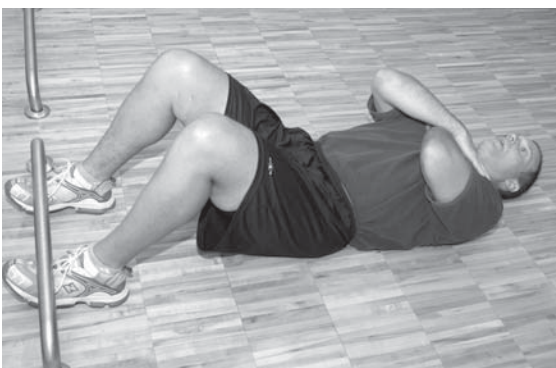
(Left) Crunches can be done with a toe hold bar or someone holding the ankles (see photo on page 1). Crunches begin in the down position with the arms crossed and the fingers touching the shoulder blades.

“It is the role of the (health and wellness centers) to develop fitness programs for both individuals and for