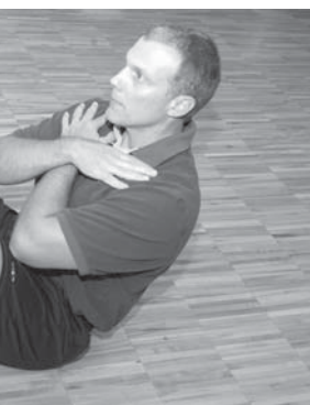
(Left) The crunch is complete when the elbows touch between the upper thighs and the knees. This is also the position that can be used to rest. (Right) Bringing the elbows above the knees is not the proper way to finish or rest.

For many who have done cardio-vascular exercises on a regular basis, the challenge may be preparing to do the push-ups and crunches portion of the assessment. According to Lou Stadler Exercise Physiologist at McConnell’s Health and Wellness center, a modified push-up can be the best way to get started. “A modified push-