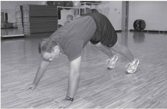
Lifting the hip into the air is an approved way to rest during push-ups.