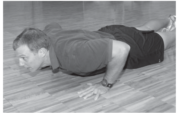
Elbows must be a little past a 90 degree angle to complete a push-up.