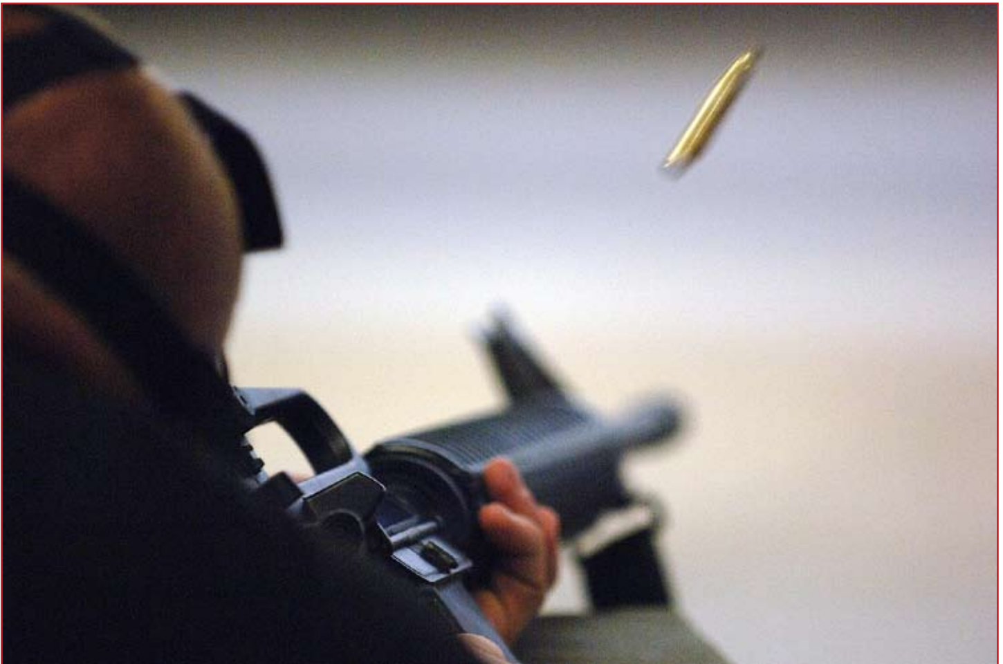
An Airman from the 931st Air Refueling Group fires a round at the McConnell Air Force Base range during the November Unit Training Assembly. Training was in full force during the previous UTAs in order to get records and certifications current prior to the upcoming Unit Compliance Inspection.

It may be a guy with a camera. Or maybe some one taking notes. A bag or package sitting in a hall is a favorite ploy.