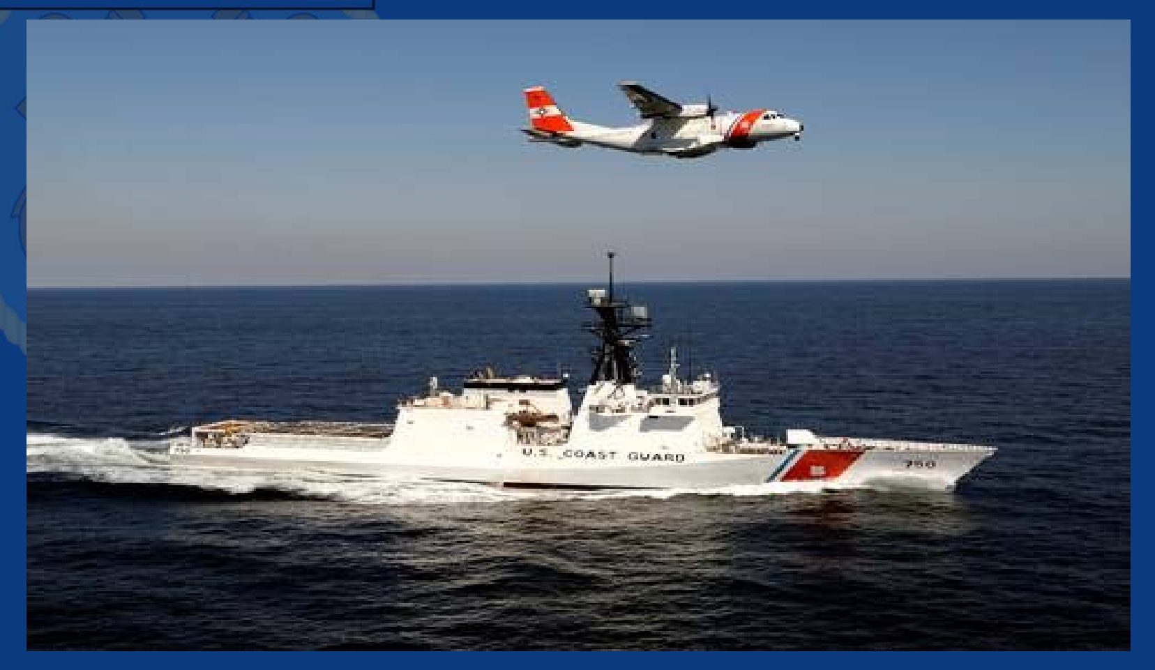
All Threats, All Hazards, Always Ready