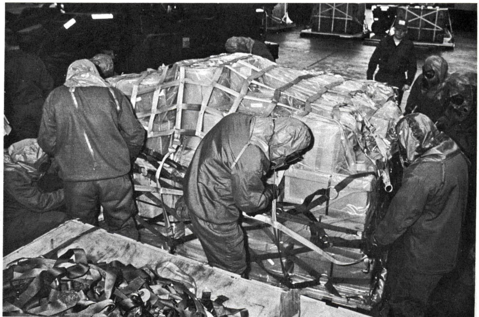
Members of the 58th MAPS palletize cargo during the February UTA, garbed in chemical warfare gear.

Presently, only Westover and Rick- enbacker ARB, Ohio are flying these aircraft.