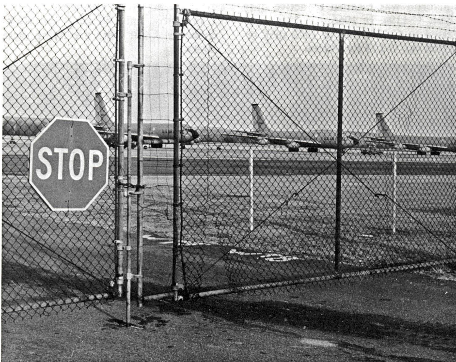
"STOP" is what it means when SAC's B52s are on Westover's flight line during Global Shield exercise.

THE PATRIOT is an Official Class II U.S. Air Force newspaper published monthly for the personnel of the 439th Tactical Airlift Wing (AFRES) at Westover AFB, MA 01022. Opinions expressed herein do not necessarily represent those of the U.S. Air Force.