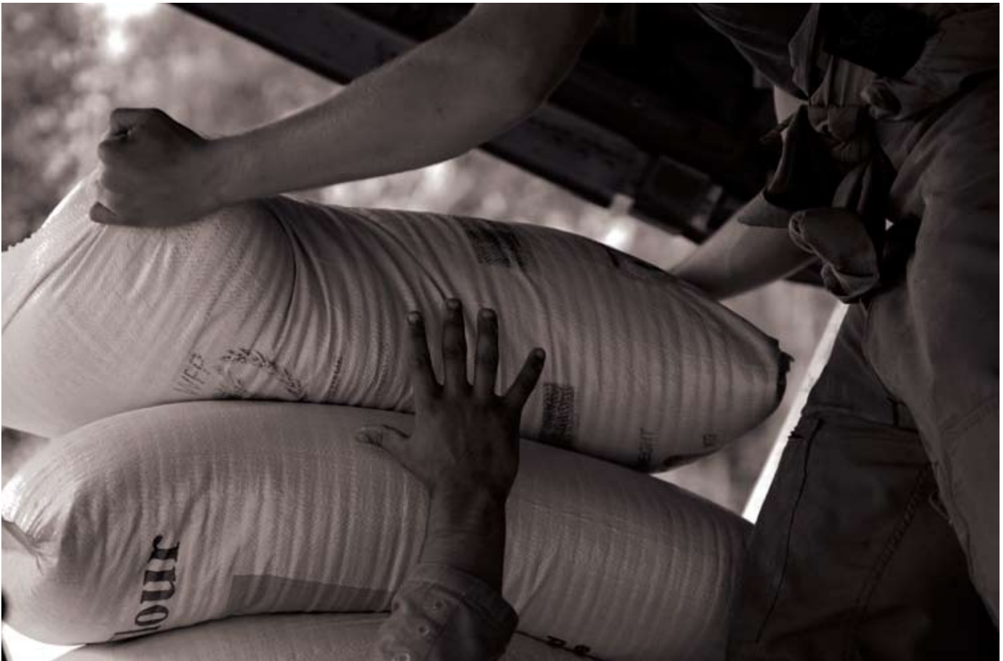
SETTING THE STAGE >> Pakistani men gather on the flight line at Gilgit Air Base, Pakistan, to help U.S. Marines offload hundreds of bags of flour from a KC-130J Super Hercules aircraft assigned to the 352nd Marine Aerial Refueler Transport Squadron (VMGR) Sept. 8, 2010. Westover contributed three C-5 missions to the flood relief efforts.