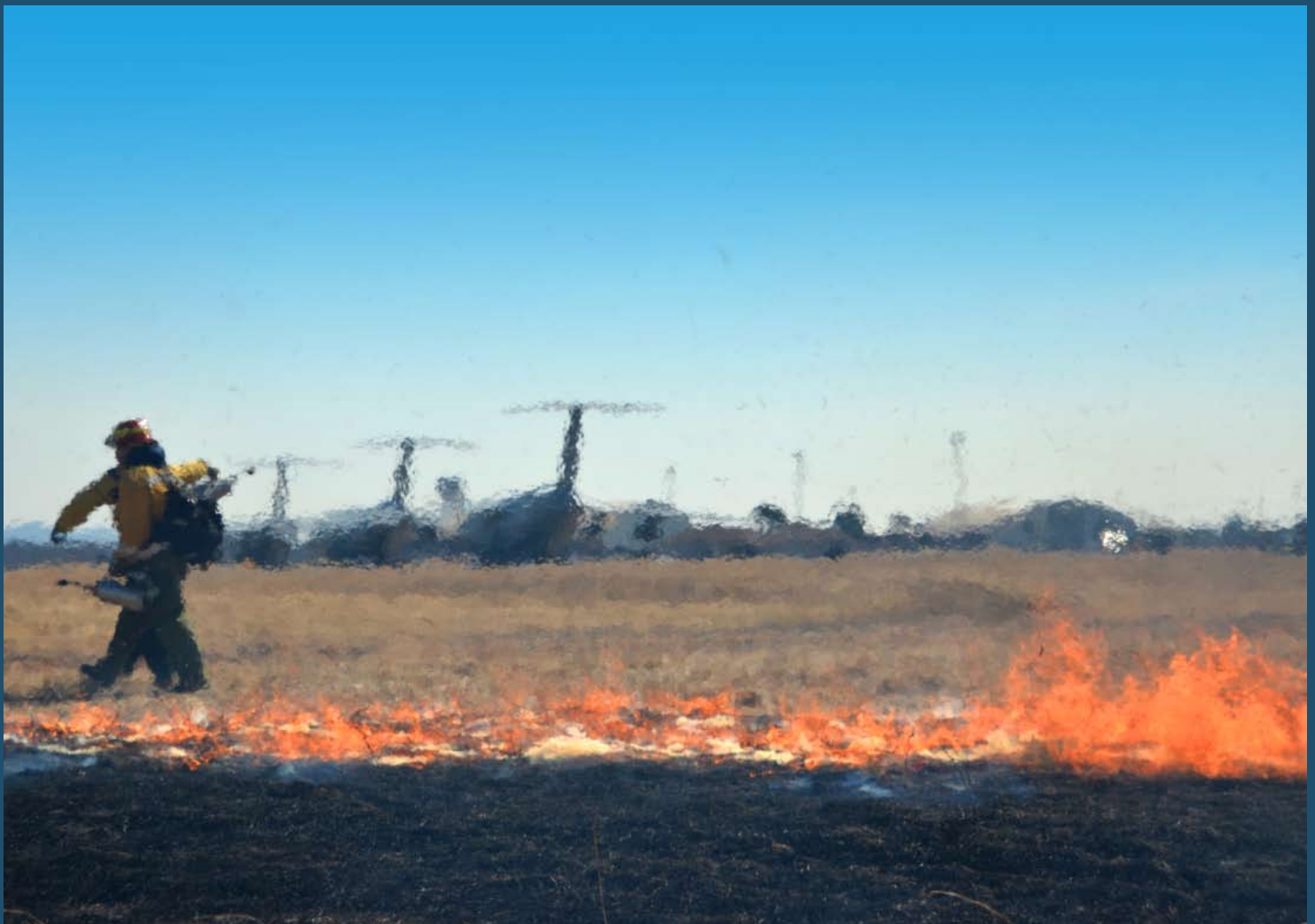
SET ABLAZE Controlled burning at Westover took place March 3. U.S. Forest Service Wildland firefighters and Westover Ffirefighters planned safe burn practices. Prescribed fire is a recognized natural resources management tool used to maintain healthy grasslands and to reduce grassy fuels. Westover's prescribed fires will help prevent wildfires and create more suitable habitat for two state-listed rare bird species: the upland sandpiper and grasshopper sparrow.

Published monthly for Patriots like SrA. Spencer Gatley, Keene, N.H., and the more than 3,400 reservists and civilians assigned to the 439 th Airlift Wing.