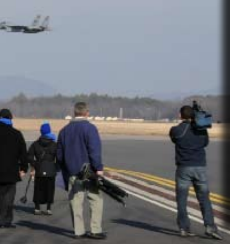
The base Top 3 Council coordinated a massive tour for 55 terminally ill children Jan. 6. The Kids of Courage group was treated to a mini air show including a Blackhawk helicopter, a C-5, and a Massachusetts Air National Guard F-15 fly-by.