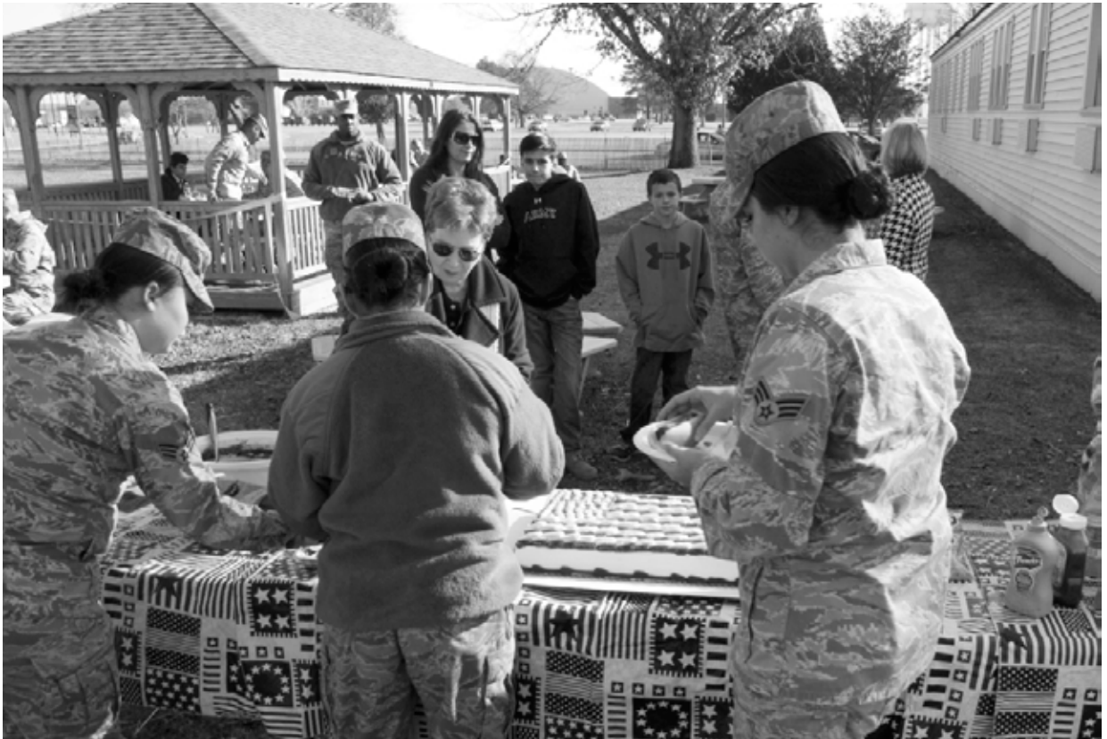
MID-WINTER BARBECUE January's unseasonable warmth helped allow the opening of a new gazebo next to the Airmen and Family Readiness Center Jan. 7. The gazebo, which seats up to eight tables and about 50 people, is available for public use. For more information, turn to page 5.

COVER PHOTO >> Westover hosted fifty-five terminally ill children Jan. 6 during the Kids of Courage tour. For more photos and story, turn to pages 6, 7 and 8.