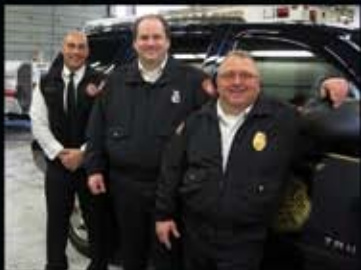
AFRC Fire Prevention Program of the Year for 2009

Westover firefighters earned the 2009 Air Force Reserve Command Fire Prevention Program of the Year award, and the isochronal inspection Airmen and civilians continued to set the standard for C-5 ISO maintenance.