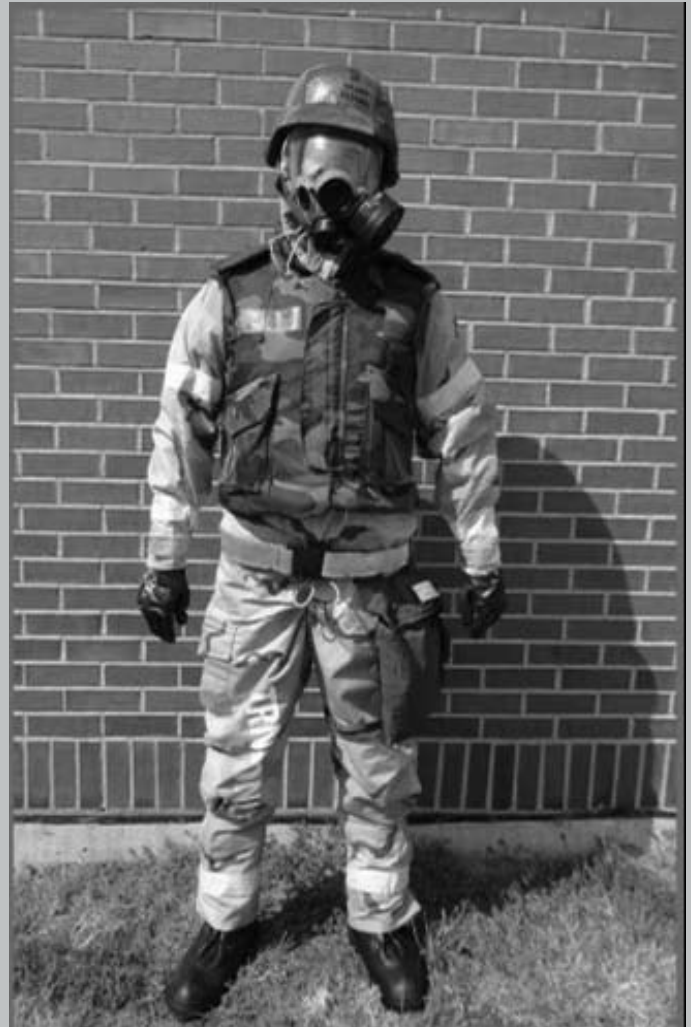
SUPER TROOP >> ORI Airmen -- test your knowledge! A) Which unit does NOT wear the reflective belt at all times? B) What is carried in the RIGHT leg pocket? C) What is carried in the large pocket inside the gas mask carrier? D) Arm band worn on wearer's left will contain which items? (See answers to questions on bottom of page 10)

The Patriot will feature monthly questions to assist Airmen of the 114th Air Expeditionary Wing for the ORI -- the flagship Air Force training exercise.