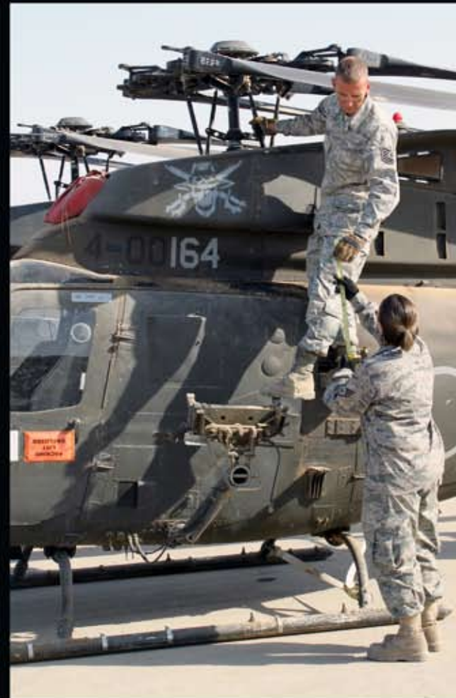
Patriot Wing aerial porters load up as part of Iraq drawdown