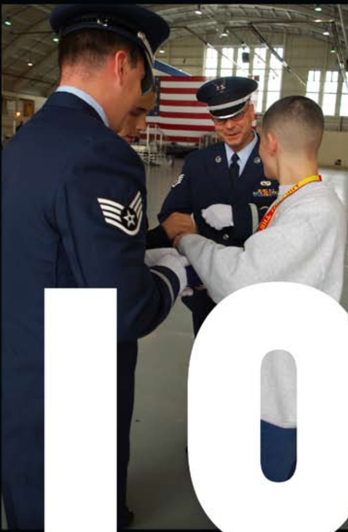
Honor guard instructs Junior ROTC students during youth symposium