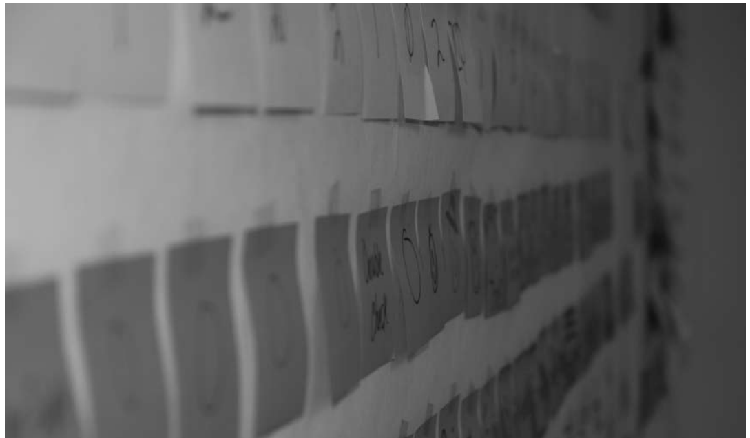
STICKING TO THE PLAN >> Sticky notes indicate tasks listed during the AFSO 21 findings with the base clinic's operations. The team found ways to improve and streamline physical and dental appointments on UTAs for reservists.

Each team member was responsible for addressing viewpoints