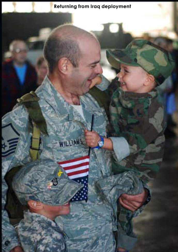
Returning from Iraq deployment