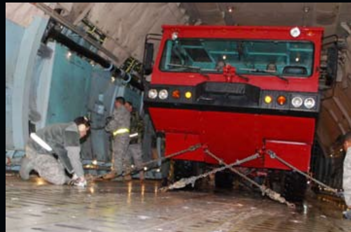
Haiti relief mission