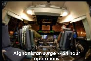
Afghanistan surge -- 24 hour operations

"This is a team effort-driven award," he said. "This award validates what every individual in this wing does: Airmen, civilians and the contractors contribute to our overall mission.