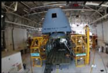
ISO dock sets command standard