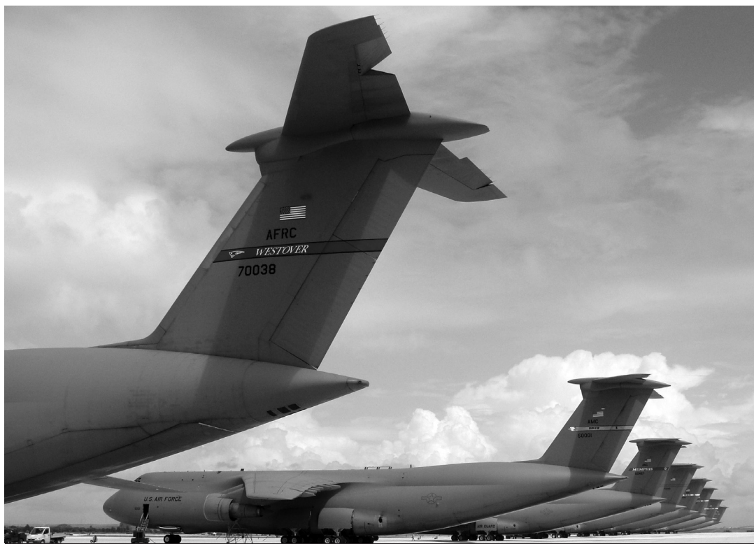
STRANDED >> The Iceland volcano forced C-5 aircrews to keep the jets on the ground at Naval Air Station Rota, Spain, until the ash cleared. These Galaxies are from Westover, Dover Air Force Base, Del., the Air National Guard in Memphis, Tenn., and Travis AFB, Calif.

As Eyjafjallajökull (pronounced ay-yah-FYAH-lah-yer-kuhl) filled flight paths over Europe with a heavy cloud of tiny volcanic particles, the crew