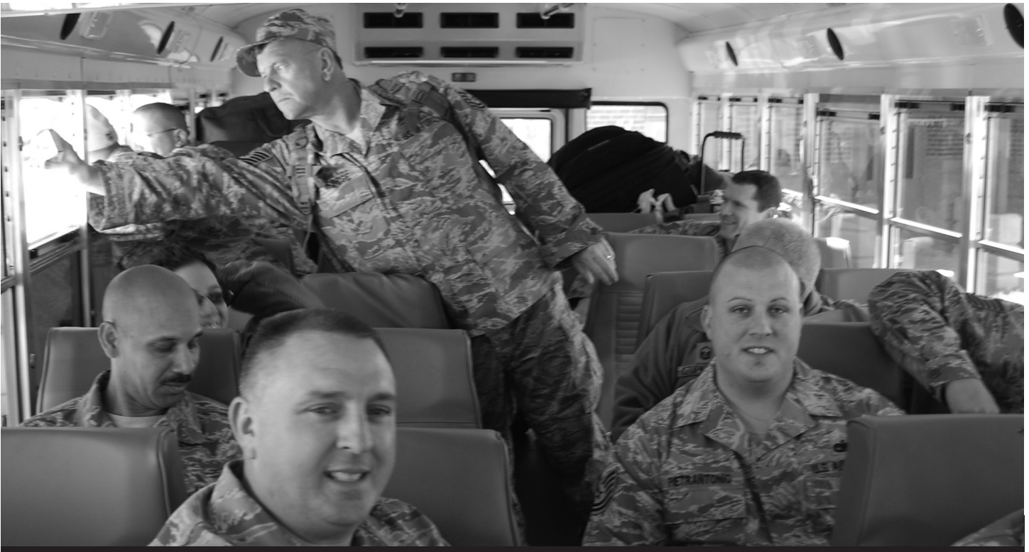
ALL ABOARD >> Aerial port reservists get ready for the first leg of their worldwide journey to Afghanistan May 5. More than 130 reservists with the 42nd and 58th APS have deployed to Afghanistan and Iraq since the surge began in April.