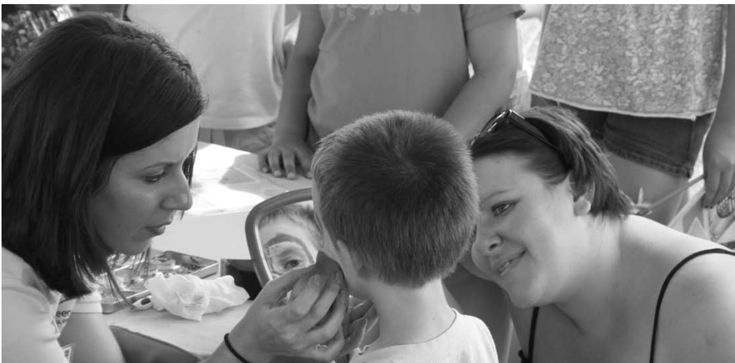
FAMILY FACES >> Family Day face painting was among the many activities offered Aug. 8 on the Base Ellipse. Nearly 4,000 family members and reservists attended the event.