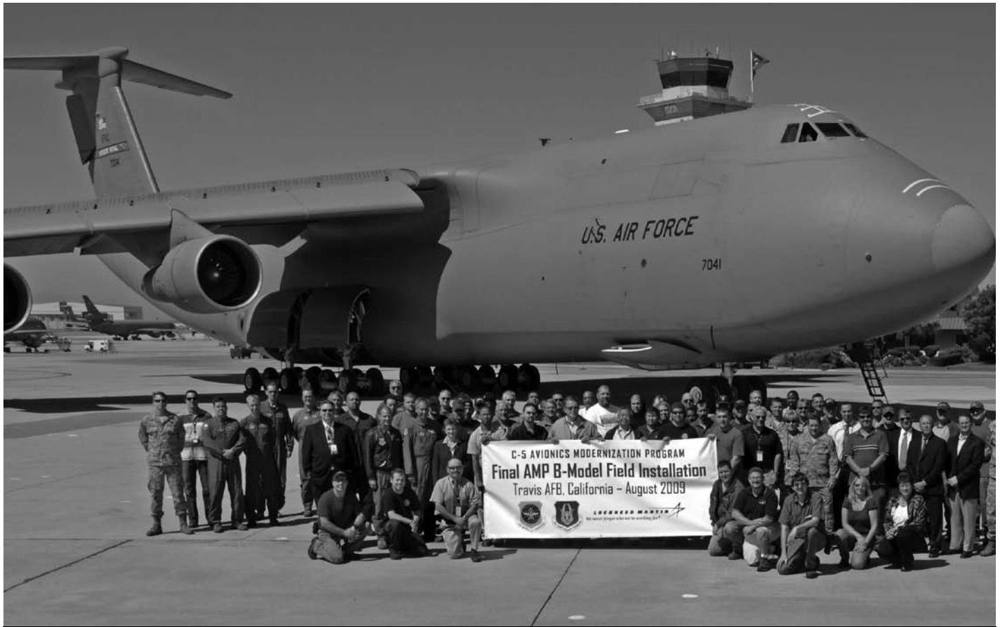
AMP CHAMPS >> Air Force and Lockheed representatives stand during the celebration of the final C-5 avionics modernization B-model (a Westover Galaxy) field installation completed at Travis Air Force Base, Calif., in August.