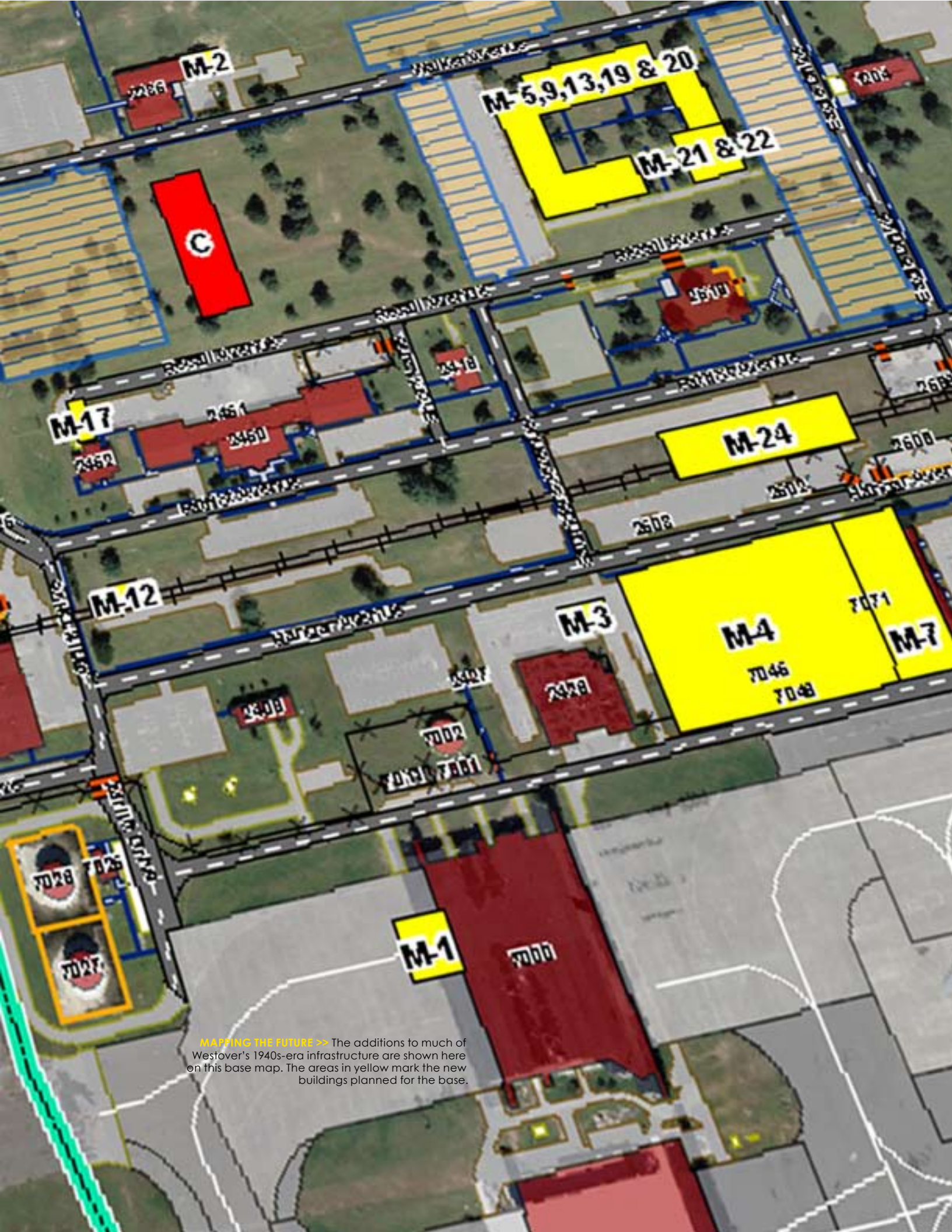
MAPPING THE FUTURE >> The additions to much of Westover's 1940s-era infrastructure are shown here on this base map. The areas in yellow mark the new buildings planned for the base.