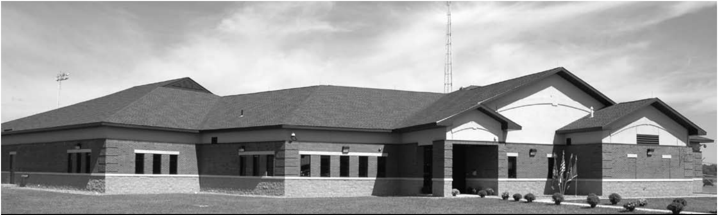
BUILDING BOOM >> The base operations building, completed in June 2007, is among several new buildings at Westover constructed to support the base's ongoing support of the Air Force and its national objectives. Additional proposed new structures planned include a new commissary, fitness center, C-5 hangars, and renovation of the Westover Club.

continued from page 7 responding to feedback, there are processes to follow, which can take time, added 439th Airlift Wing Commander Col. Robert Swain. "Simply wanting a facility is not enough, especially in our current economic climate; and we must validate the need and have our projects prioritized on the MILCON (military construction list)," he said. "The good news is we have great support of our local and state representatives, and many of our projects are validated or being validated."