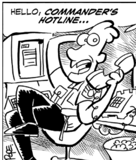
Commander's Hotline Extension 3774