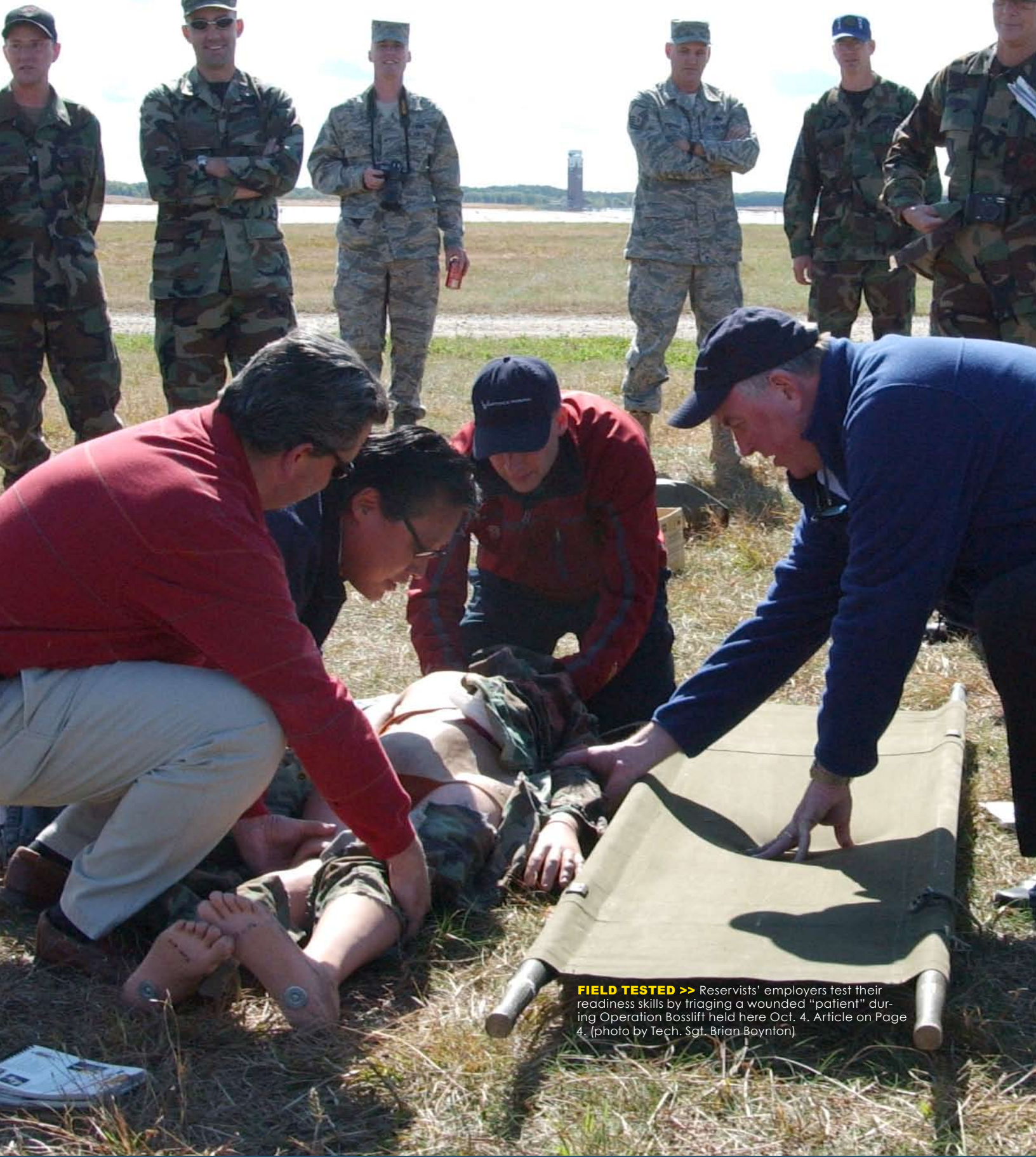
FIELD TESTED >> Reservists' employers test their readiness skills by triaging a wounded "patient" during Operation Bosslift held here Oct. 4. Article on Page 4.

Actively Supporting National Objectives With Ready Mobility Forces