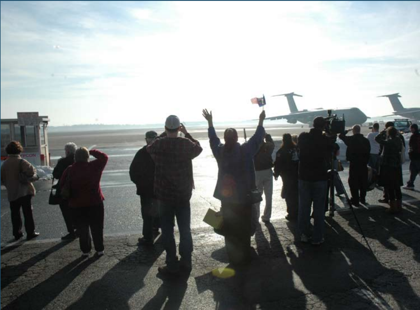
HOMEFRONT SUPPORT >> Family members of deploying Reservists wave to Airmen departing Westover on their first leg of the overseas deployment. More than 180 Airmen from three squadrons deployed in January for the Global War on Terror.