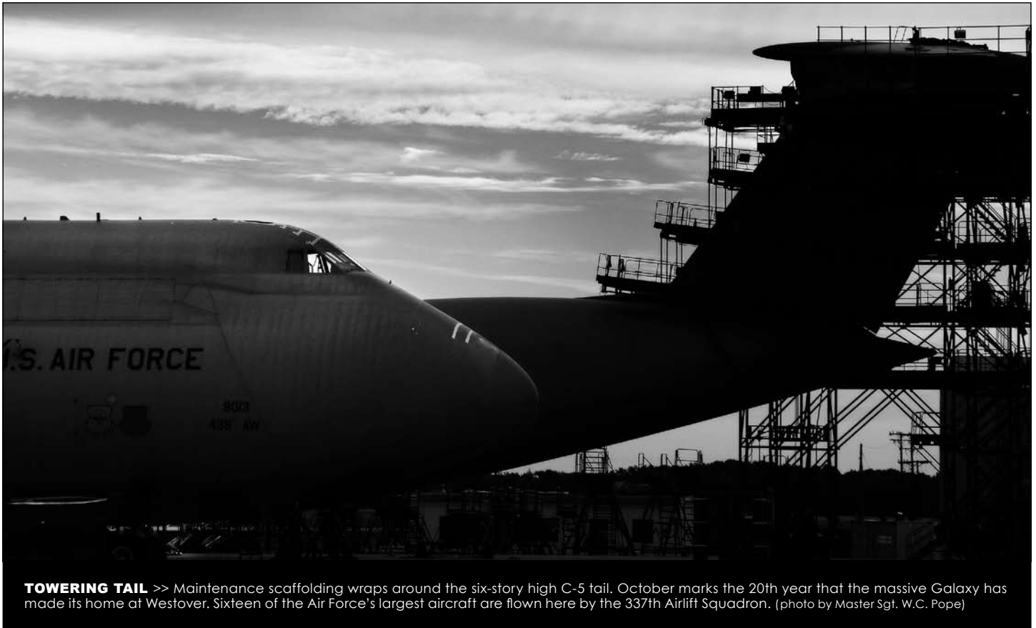
TOWERING TAIL >> Maintenance scaffolding wraps around the six-story high C-5 tail. October marks the 20th year that the massive Galaxy has made its home at Westover. Sixteen of the Air Force's largest aircraft are flown here by the 337th Airlift Squadron.