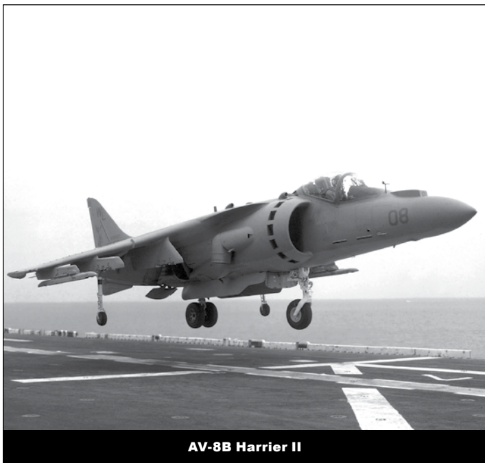
AV-8B Harrier II

NAME : AV-8B Harrier II LENGTH : 46.3 feet WING SPAN : 30.3 feet MANUFACTURER : McDonnell Douglas PROPULSION : One Rolls Royce F402-RR-408 turbofan engine PRIMARY FUNCTION : Attack and destroy surface targets CREW MEMBERS : 1 UNIT REPLACEMENT COST : $23,700,000 INTRODUCTION DATE : Jan. 12, 1985, AV-8BII(Plus) was introduced in June, 1993 MISSION : To attack and destroy surface and air targets, to escort helicopters, and to conduct other air operations as directed. Able to deploy to and operate from carriers and other suitable seagoing platforms, advanced bases, expeditionary airfields, and remote tactical landing sites. ARMAMENT : MK-82 series 500lbs bombs, MK-83 series 1000lbs bombs, GBU-12 500lbs laser guided bombs, GBU-16 1000lbs laser guided bombs, AGM-65F IR Maverick missiles, AGM-65E Laser Maverick missiles, CBU-99 cluster munitions, AIM-9M sidewinders, Lightning II targeting POD to deliver GBU-12 and GBU-16 bombs with pinpoint accuracy.