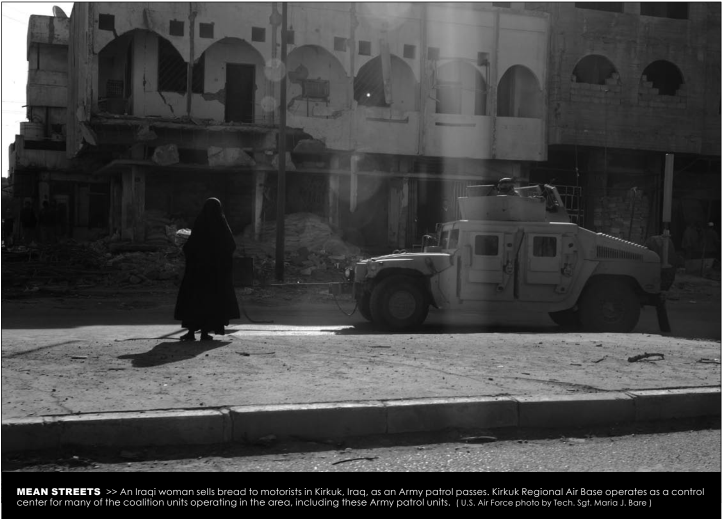
MEAN STREETS >> An Iraqi woman sells bread to motorists in Kirkuk, Iraq, as an Army patrol passes. Kirkuk Regional Air Base operates as a control center for many of the coalition units operating in the area, including these Army patrol units.