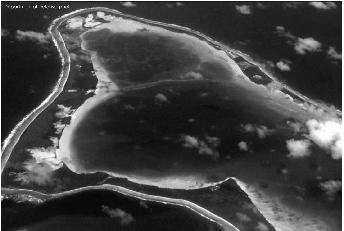
ISLAND FORTRESS >> An aerial photo of Diego Garcia, a joint naval and Air Force base in the Indian Ocean. The small island is mostly populated by military personnel who support the base's operations. Although controlled by the British, the U.S. military has the largest presence on the island.

The airfields in and around Guam were an invaluable military resource during the Second World War. It was the only populated U.S. territory to be occupied by the Japanese, but was liberated in a major naval operation to recapture the Mariana Islands. The Mariana Islands were used by B-29s to provide heavy bomber support for the island-hopping campaigns in the Pacific and to attack the Japanese mainland. Tinian, one of the Mariana Islands, was the launching point for the Enola Gay's atomic strike on Hiroshima.