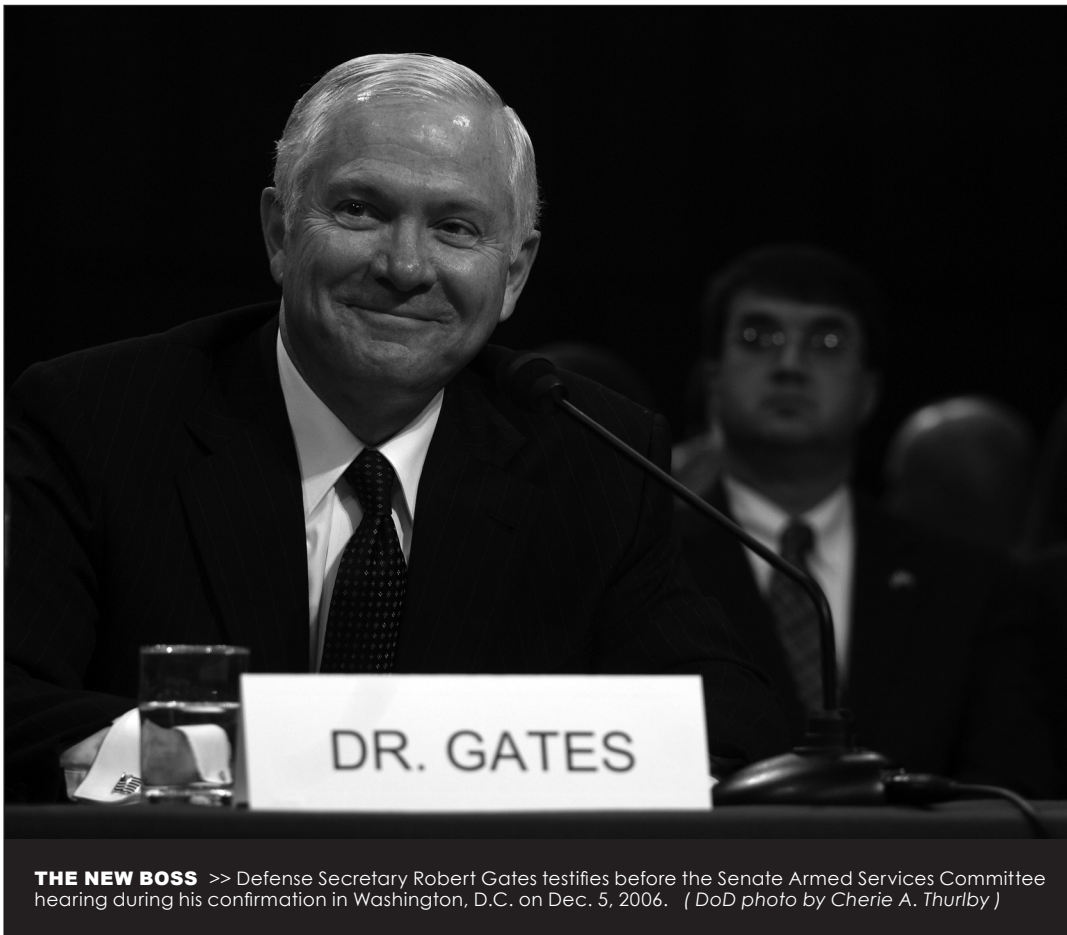
THE NEW BOSS >> Defense Secretary Robert Gates testifies before the Senate Armed Services Committee hearing during his confirmation in Washington, D.C. on Dec. 5, 2006.