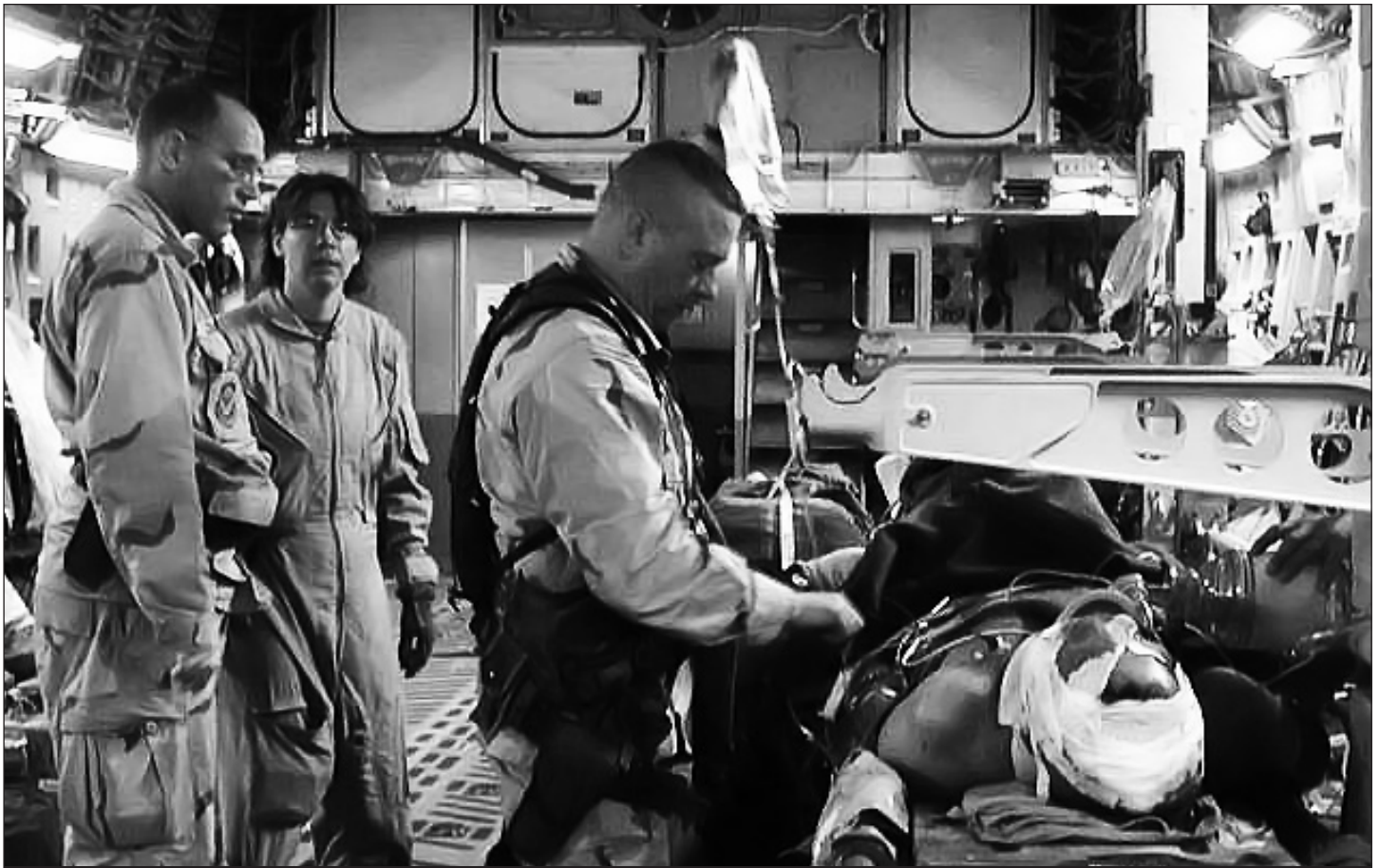
HOSPITAL IN THE SKY >> Members of the 439 th AES treat a patient aboard a C-17 during the 2003 invasion of Iraq. The AES is currently at Andrews AFB, Md. helping with the transit of patients from overseas locations to medical facilities in the U.S. ( file photo )