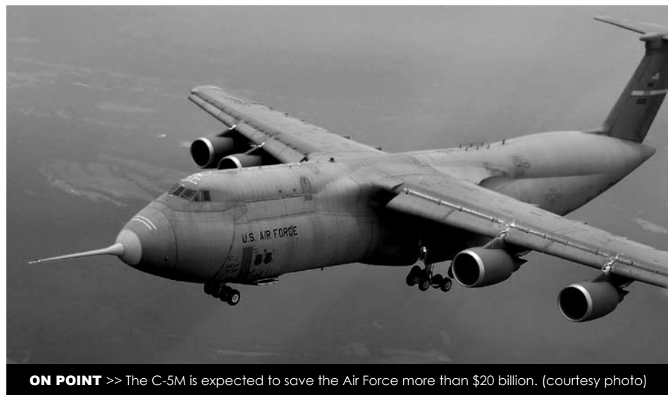
ON POINT >> The C-5M is expected to save the Air Force more than $20 billion.