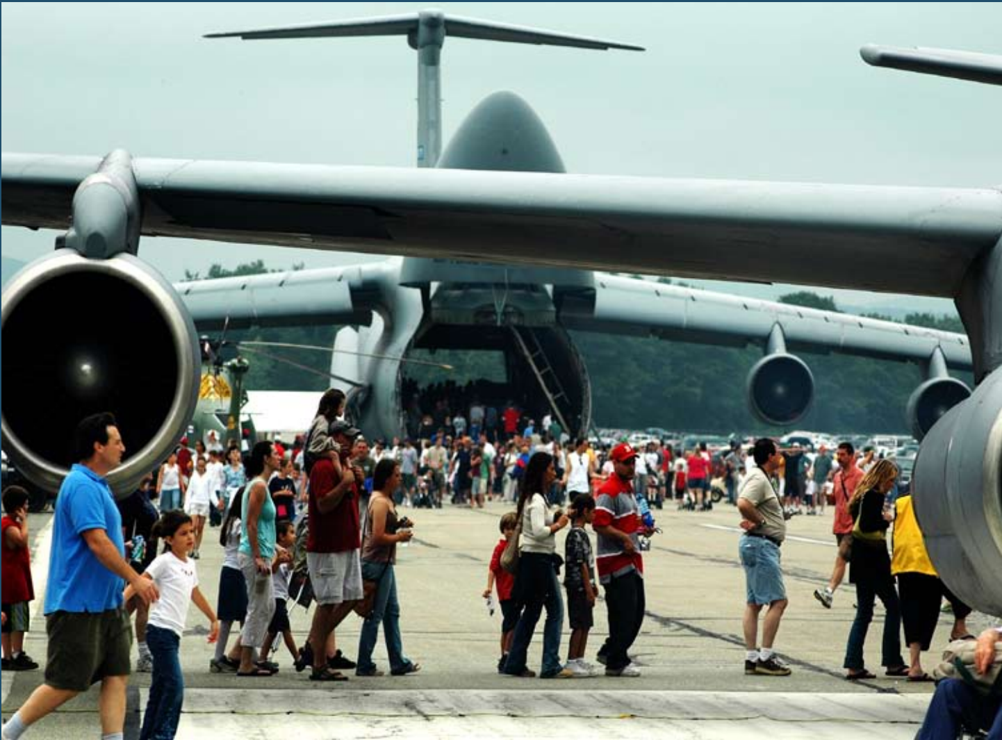
WIDE OPEN SPACES >> Hundreds of people file through a Patriot Wing C-5 at the Westfield International Air Show June 25 at Barnes Air National Guard Base. Another 439 th Airlift Wing Galaxy also took part in the air show, with a fly-by in front of the more than 70,000 people who attended the two-day event. The U.S. Navy Blue Angels headlined the show.