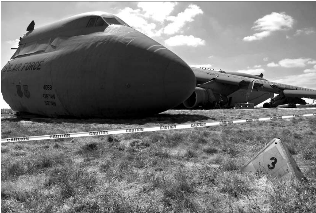
ALL QUIET >> Air Force C-5B number 84059 lies broken in a field on the south side of Dover AFB, Del., after it crashed in April. Four Westover personnel were chosen to cross the caution tape to inspect the scene as part of Air Mobility Command's safety investigation board.