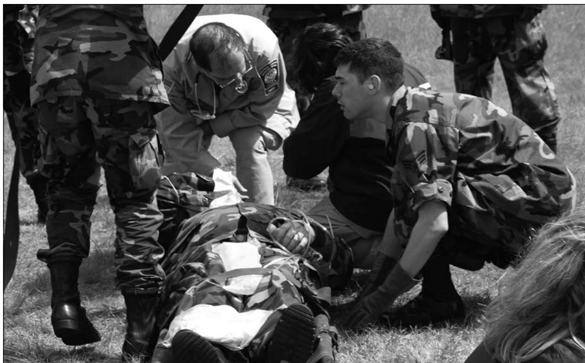
EXERCISING PATIENTS >> Westover's medical units joined with Army reservists for Team Yankee during May's B UTA. The exercise featured war and peacetime scenarios, including a Katrina-like flood. Story on page 6.