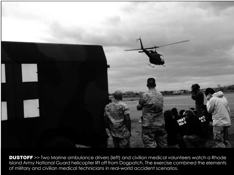
DUSTOFF >> Two Marine ambulance drivers (left) and civilian medical volunteers watch a Rhode Island Army National Guard helicopter lift off from Dogpatch. The exercise combined the elements of military and civilian medical technicians in real-world accident scenarios.

tours in the wake of Hurricanes Katrina and Rita. More than half the DMAT medical specialists had been at ground zero at the World Trade Center shortly after the Sept. 11 attack.