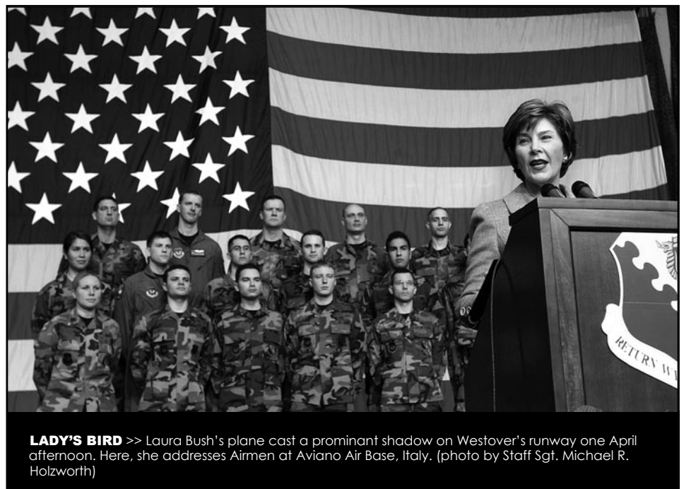
LADY'S BIRD >> Laura Bush's plane cast a prominent shadow on Westover's runway one April afternoon. Here, she addresses Airmen at Aviano Air Base, Italy.

The C-40, a close cousin of the 737-700, is used by both the Air Force and Navy. The Air