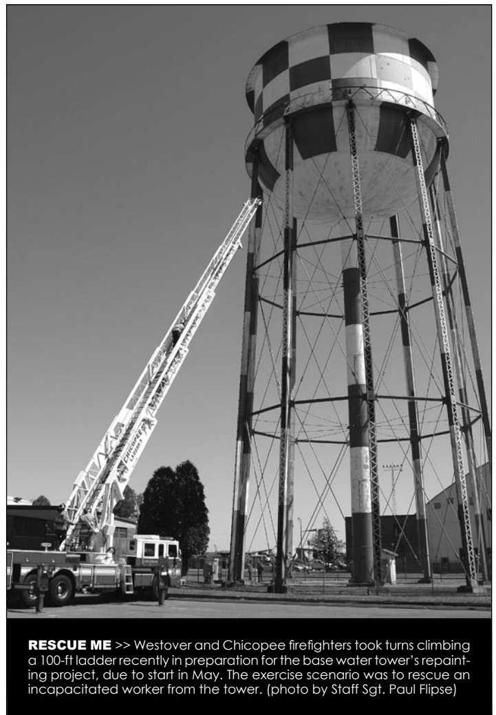
RESCUE ME >> Westover and Chicopee firefighters took turns climbing a 100-ft ladder recently in preparation for the base water tower's repainting project, due to start in May. The exercise scenario was to rescue an incapacitated worker from the tower.