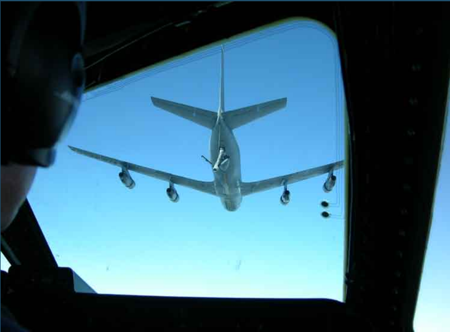
IF YOU CAN READ THIS BUMPER STICKER... >> A Patriot Wing C-5 moves closer to an awaiting KC-135E Stratotanker during air-to-air refuel training. The weekly missions, flown over New England and New York, are mandatory for Westover C-5 pilots.