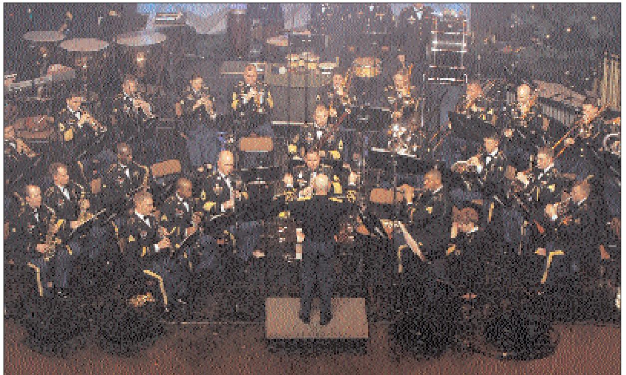
The 2ID Warrior Concert Band performs holiday music during the 2008 Korean-American Holiday Concert held Dec. 9 at the Uijeongbu Arts Center. The event, which was co-hosted by 2ID and the Gyeonggi Provincial Office II, included songs to commemorate Christmas, Hannakah and Kwanzaa, as well as some popular Korean tunes.