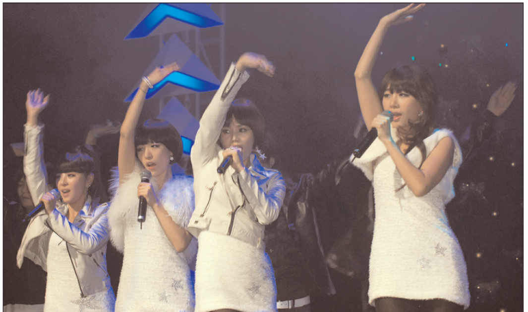
The Brown Eyed Girls, a Korean pop group, perform for the audience.