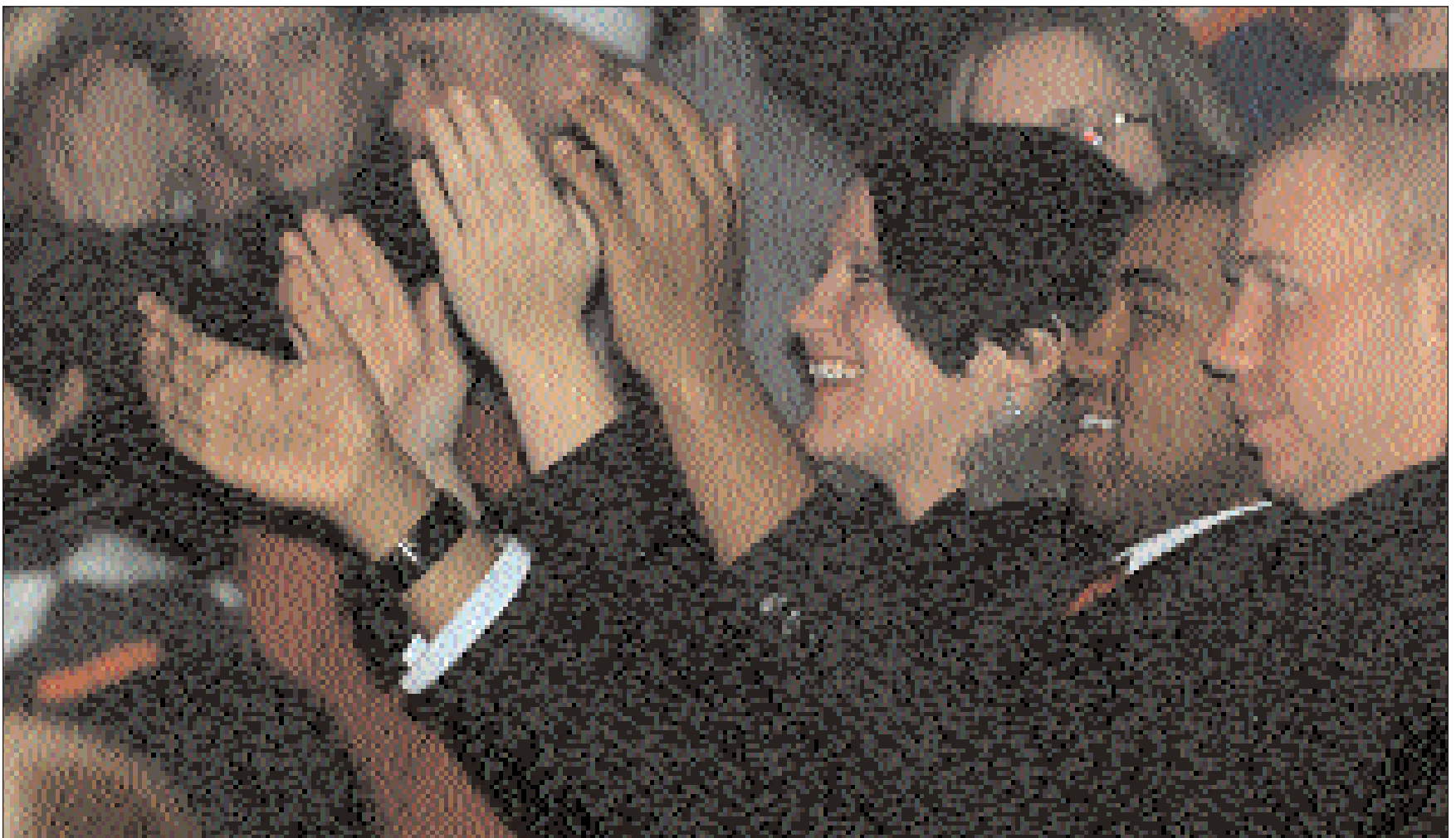
Soldiers applaud one of the performances during the the 2008 Korean-American Holiday Concert held Dec. 9 at the Uijeongbu Arts Center.