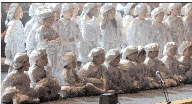
Children perform "Twinkle, Twinkle little Star."