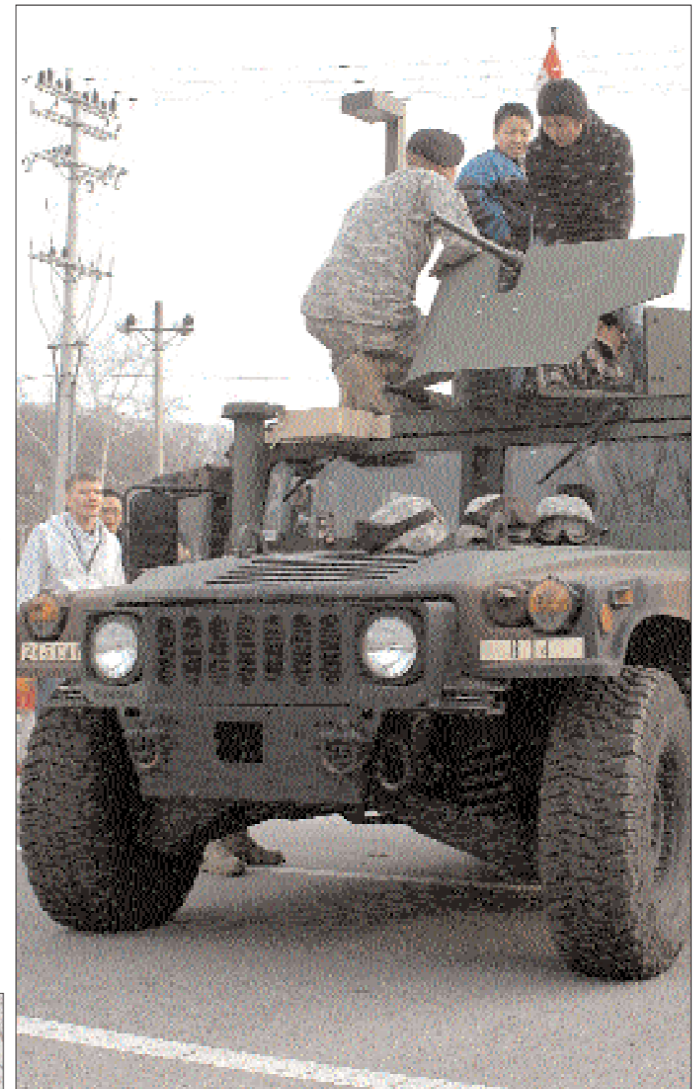
Children sit in the turret of a HMMWV while a Soldier from 4-7 Cav. talks to them.