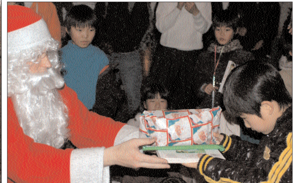
Santa Claus presents one of 48 children with a wrapped gift. Every child received two gifts and a book.