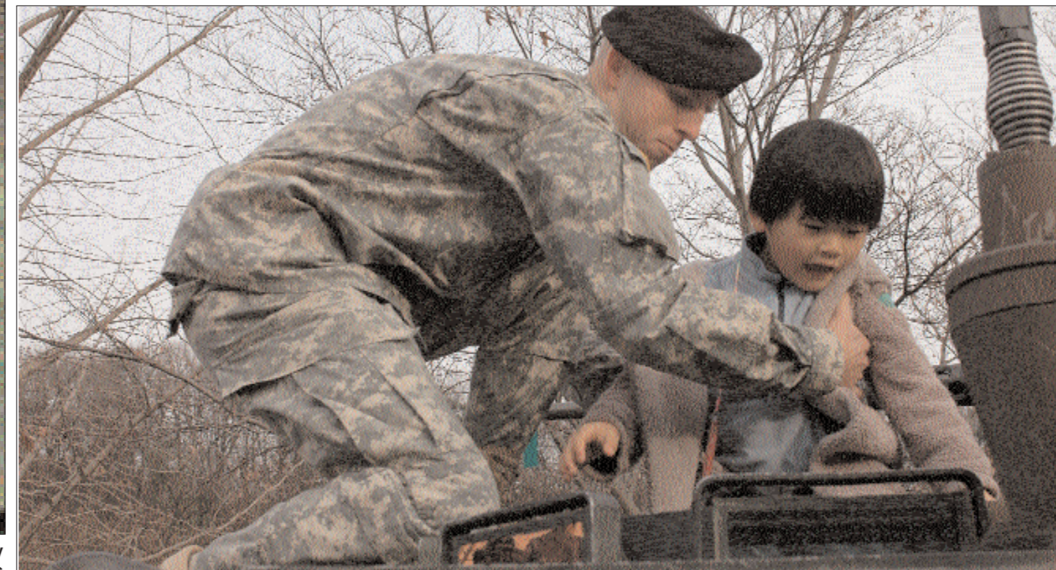
A Soldier with 4-7 Cav. helps a child out of a Bradley Fighting Vehicle. The children used the four military vehicles as a playground.