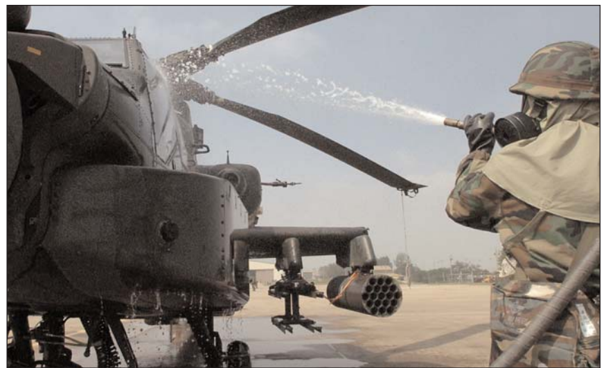
A Soldier with the 51st ROK Chemical Platoon decontaminates an AH-64D Apache helicopter at Black Cat Ramp Sept. 12 during decontamination training in the second of five decontamination stations.

During the day-long exercise, Soldiers with 4-2 and the 51st ROK Chemical Platoon trained on both aircraft and land vehicles, including