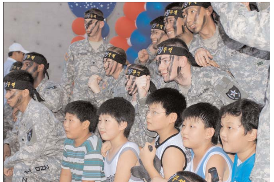
The 2ID Taekwondo Demonstration Team and local children pose for a picture before their demonstration performance. Free barbeque and many entertainment acts were prepared by 2ID for the local community of Youngjung-myeon, Pocheon, at the district office July 31. Soldiers from 1st HBCT and the 2ID Warrior Band were also present to support the Good Neighbor Program.

After the barbeque, Youngjung-myeon presented a program to accommodate older people, such as