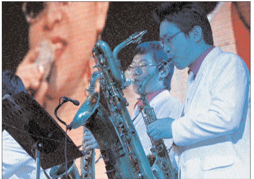
Top: A performer from the Guerilla Performance Team waves as he marches through the crowd. There will be a costume parade at Yeouido Park every evening of the festival. Above: A jazz band plays on the stage for the last year's Hi Seoul Festival. Left up: A dragon-headed canoe competes in the boat race on Han River in the preliminary stages. The final race will take place on the last day of the festival, Aug. 17. Left down: Swimming participants lined up to cross the Han River Aug. 10, as a part of last year's Hi Seoul Festival.