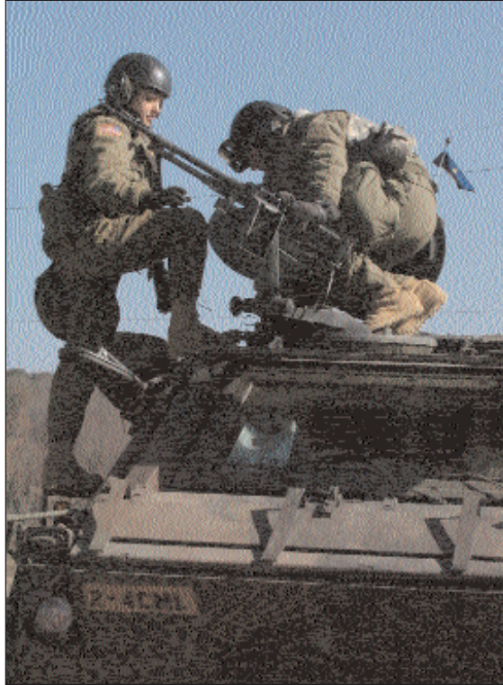
Two Soldiers from 4th. Chem. Co., BSTB, conduct preventative maintenance checks and services on their M92A1 NBC Reconnaissance System Vehicles (FOX) while on a field training exercise Feb. 10-14.