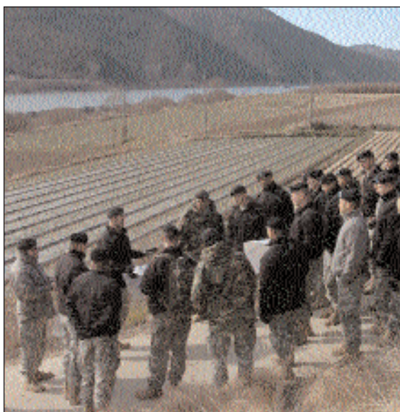
Leaders from the 2nd Bn., 9th Inf. Regt. gather at the Naktong River, the site of a two-week battle in August 1950. Enemy forces built a bridge at night in an attempt to cross the river and conduct a surprise attack.