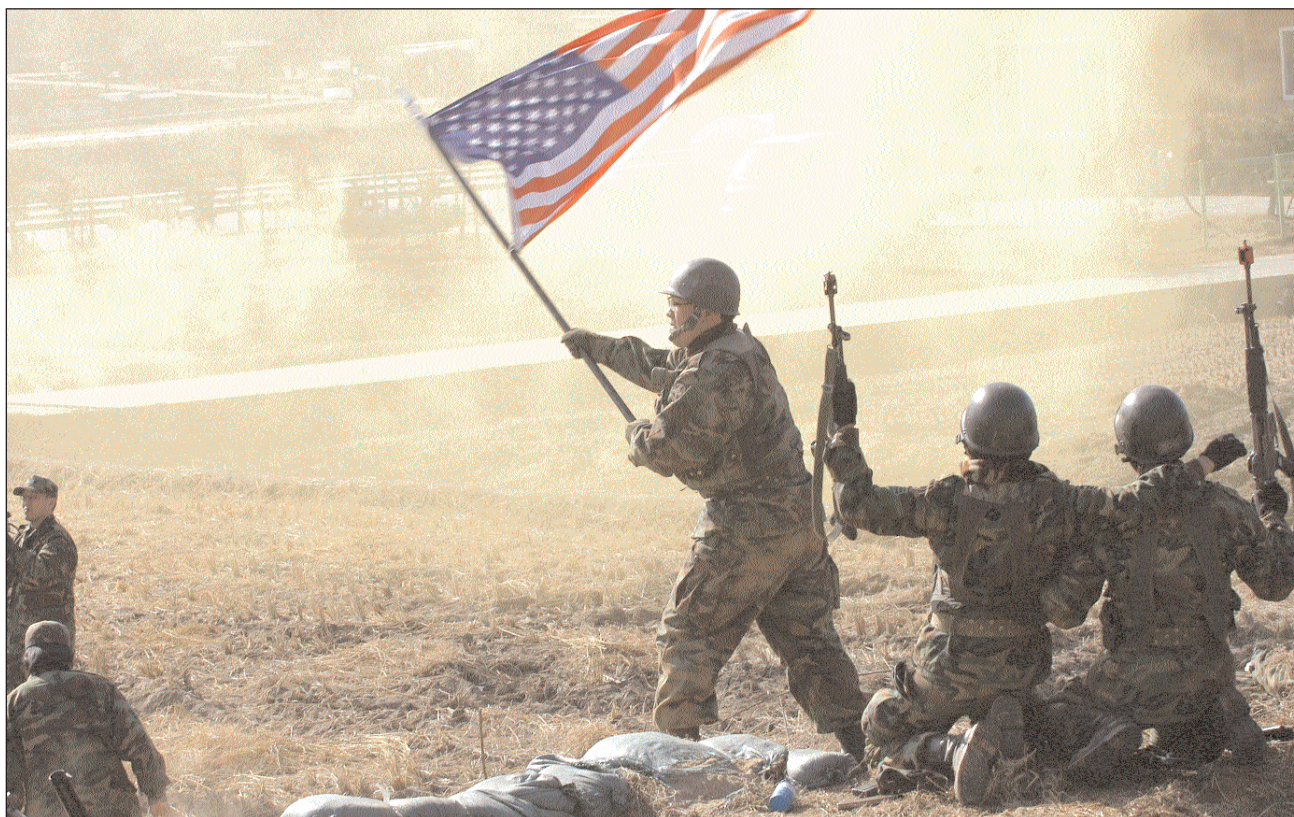
Yu, Hu Son

The victory at Chipyeongri changed the whole wartime situation at that moment. It gave back strategic control, which had been held by Chinese Communist Forces up to that point, to the combined forces. Consisting of the 23rd Regiment of 2ID and the French Army battalion, it was the first defeat of the CCF since fighting had begun in Korea. As a result of this battle, the United Nations forces pushed the CCF to the 38th parallel. In spite of the overwhelming number of enemies, the U.S., ROK and French Army