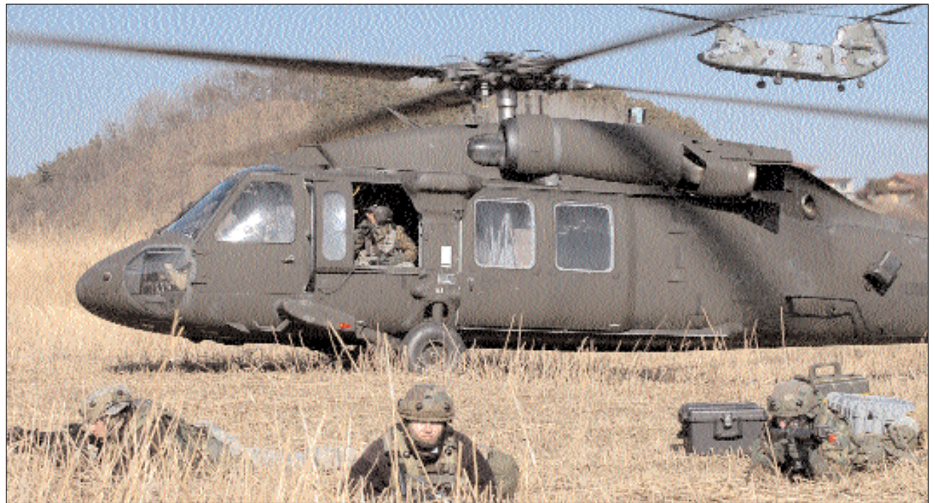
Soldiers from the 2nd Bn., 2nd Aviation Regt. pull security for a DART team during a joint exercise with the ROK's 301st Avn. Bn. at TAA Jerry, Jan. 30.