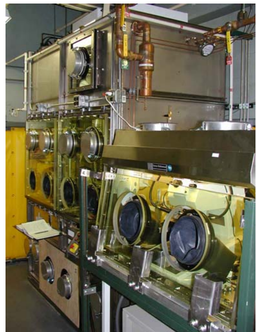
Instron Model 8511 Material Testing System