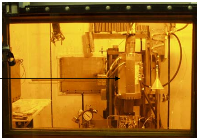
In-cell LOCA Apparatus