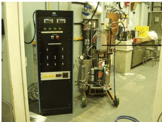
LOCA Apparatus Out-of-cell