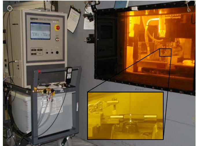
Remotely-Operated EDM in IML Cell 3 (inset image shows cutting of LWR cladding)