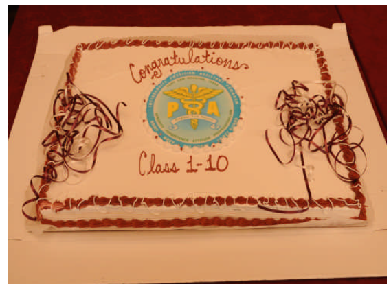
IPAP 1-10 Cake