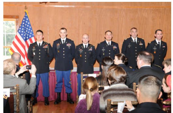
WAMC IPAP Class 1-10 Graduates