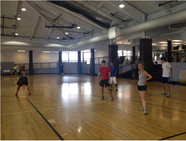
IPAP and Methodist students play volleyball after Journal Club