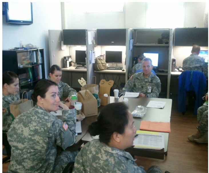
LTC Campbell presents PAs, medical NCOs and IPAP students with a briefing on the Medical Evaluation Board and the Integrated Disability Evaluation System

For the IDES Training Curriculum, check out http://www.pdhealth.mil/hss/ides.asp and receive CME credit.