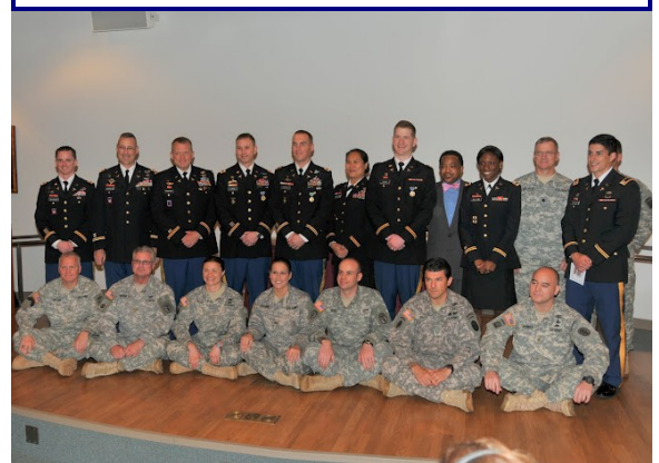
Fort Bragg physician assistants, students and WAMC leadership pose for a picture after the graduation ceremony