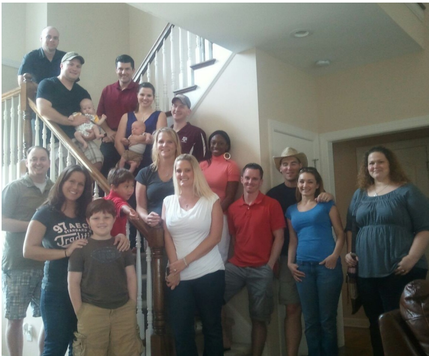
IPAP Students and their families gather for a Hail and Farewell on 29 Aug 2012