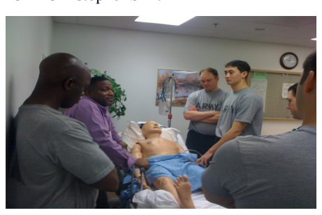
Sim Training WAMC HESD