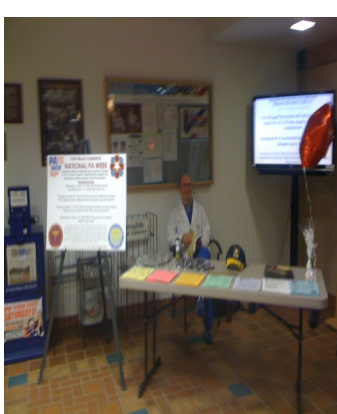
PA Week Booth

You can see more pictures during our events along with other PAs all over the country on the AAPA Facebook Page at <a href="http://www.facebook.com/">http://www.facebook.com/</a>